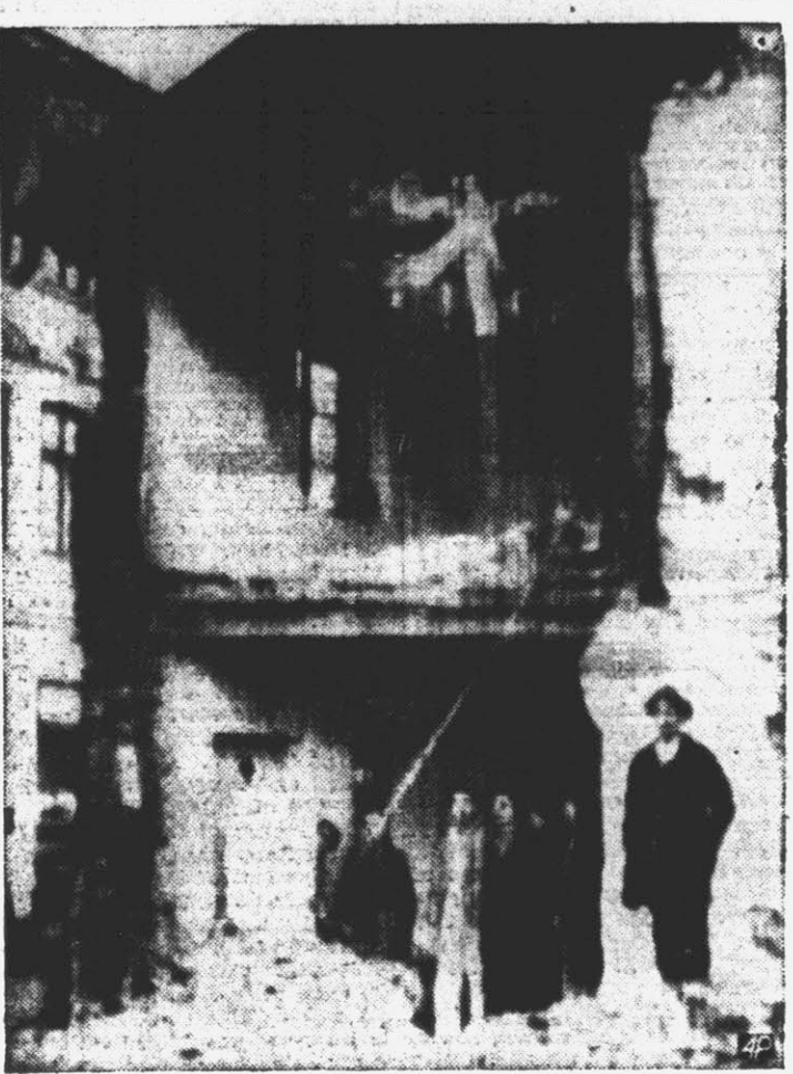
The Rumanian earthquake which killed nearly 1,000 persons did this to a home in Bucharest. The city's death toll alone amounted to more than 300 in Sunday's quake. (This picture by radio from Berlin).