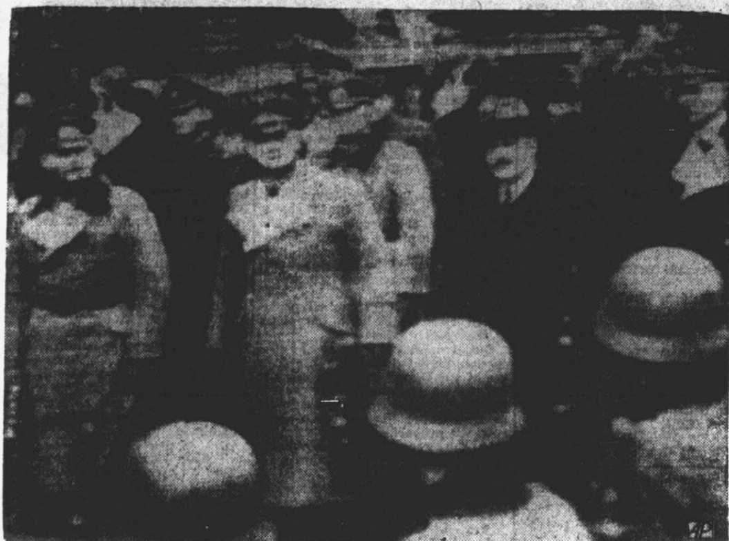
Vyacheslav Molotoff (third from left), Russian premier-foreign commissar, reviewed a guard of honor on his arrival in Berlin for diplomatic conferences with Axis powers. Left to right in this radiophoto: German Field Marshal Wilhelm von Keitel, German Foreign Minister Joachim von Ribbentrop, and Molotoff. The scene is at the Anhalter station.