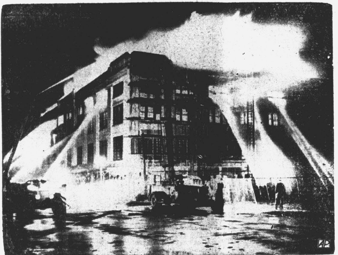
Damage estimated at $500,000 was done by fire which swept a portion of the million dollar armory-auditorium in Atlanta, Ga. Firemen battle the conflagration as flames and smoke leap from windows and roof. Col. T. L. Alexander, commander of the 179th Field Artillery, an aid army equipment valued at $150,000 to $200,000 was destroyed. Mayor W. B. Harrisfield estimated damage to the building at $350,000.