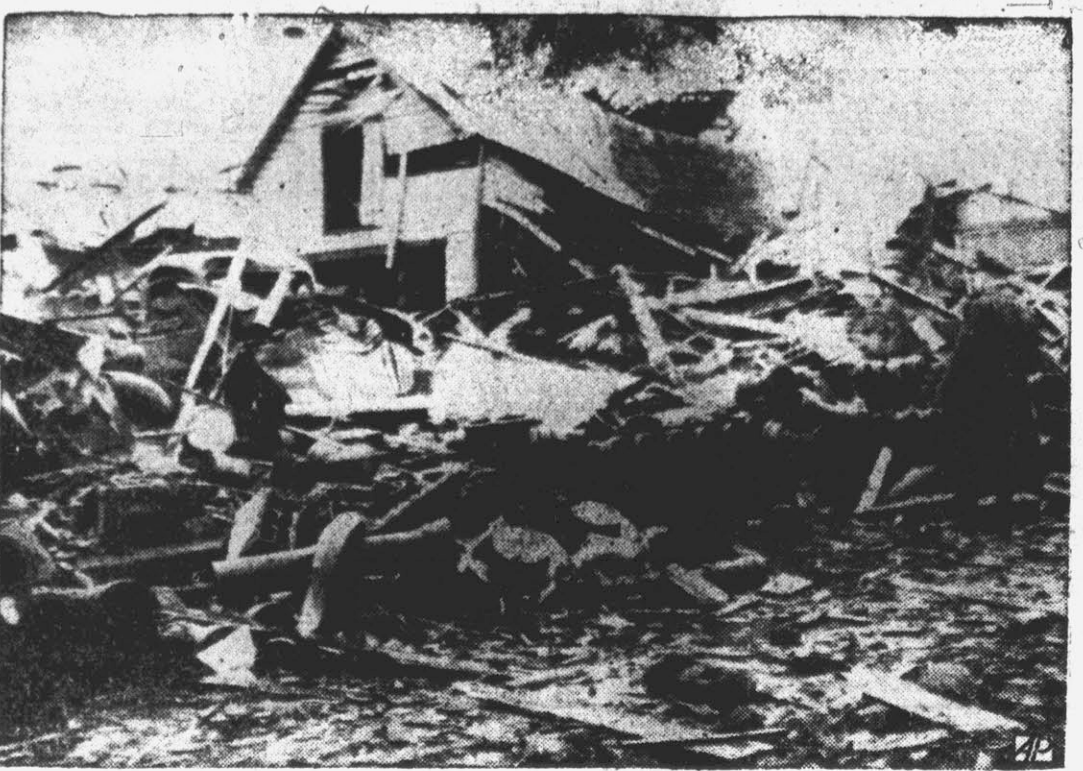
A policeman surveys damage to a plant at Woodbridge, N. J., which manufactured railway signal and flare equipment and which was leveled by a terrific explosion. Estimates of the number killed in the blast varied but it was known that at least five perished and a score were injured.