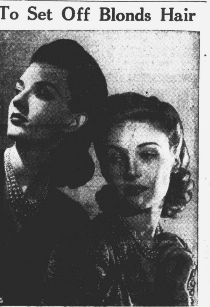
Brunette . . . or . . . Blonde?

"Five bucks, downed by noon," said a message attached to one bird found dead near a Longmont highway "Call Ray's folks." The message-carrying pigeon had struck an electric power line.