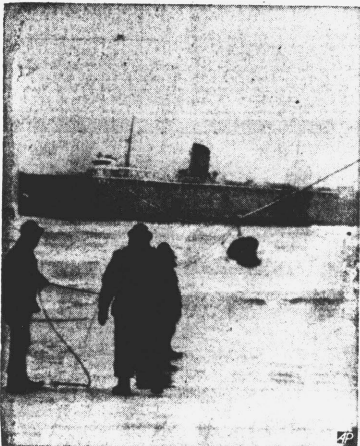
The car ferry City of Flint was aground at Ludington, Mich., with four passengers and a 42-man crew aboard following a severe lake storm which took a heavy toll of lives. Coast Guardsmen have just attached a breeches buoy to the vessel. At least 88 persons were known to be dead in the cold waters of Lake Michigan and the frozen marshlands of the Great Lakes region.