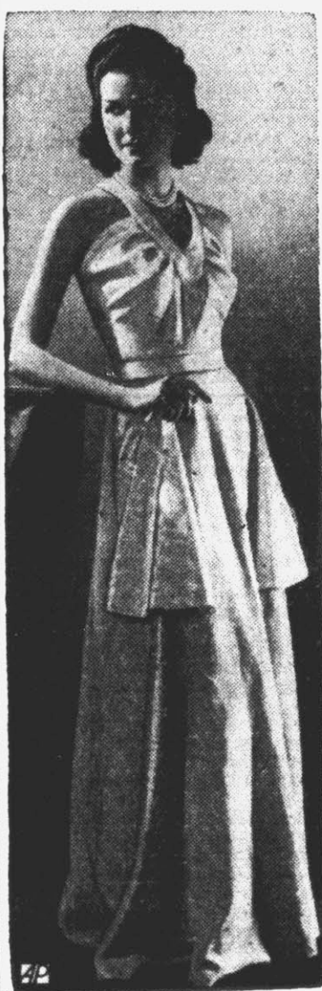
Typical of the easy to wear gowns shown at Mainbocher's opening. Of heavy white damask.