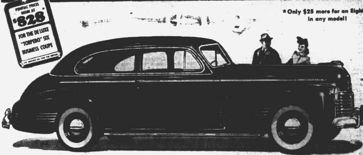
Model Illustrated: De Luxe "Torpedo" Six Two-Door Sedan $874* (White sidewall tires optional at extra cost)

Just arrived—and now on Special Display—the Value Leader of Three Great New Lines of "Torpedo" Sixes and Eights