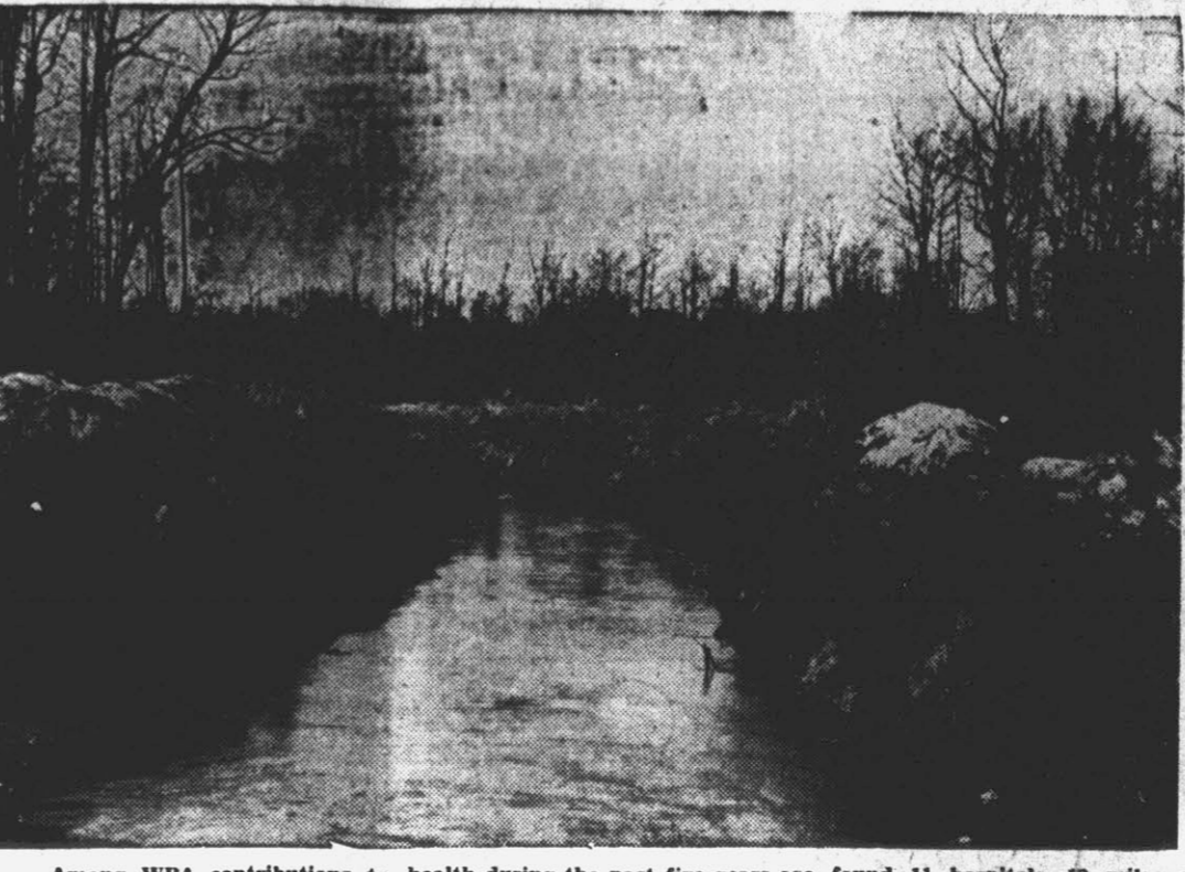
Among WPA contributions to health during the past five years are found 11 hospitals, 12 miles of sewers and water mains, 131,456 sanitary privies, 44 utility plants, 32 sewage disposal plants, 33 water reservoirs, 13 water treatment plants, 2407 miles of malarial control drainage. The above scene on Conoco Creek in Pitt county is a typical watery path left by WPA dredges. They prevent many farm acres from flooding and breeding places of the dread anopheles mosquito were destroyed.