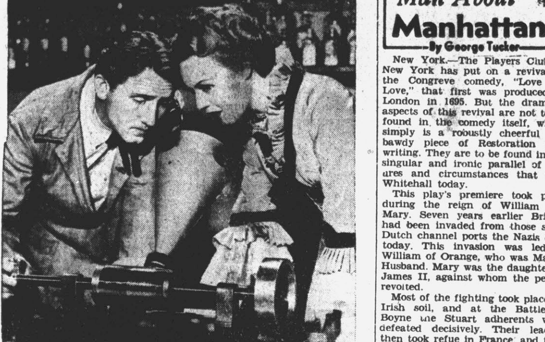
Scene from "Edison The Man", starring Spencer Tracy with cast including Rita Johnson at Pitt Today, Sunday and Monday.