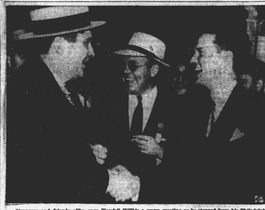
Strangers and friends alike gave Wendell Willkie a warm greeting as he stepped from his Philadelphia hotel following his early morning nomination as the Republican presidential candidate. Here's a scene as well-wishers around the victorious candidate.