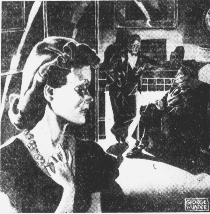
An inner tumult threatened her peace of mind.

Money, to Tomi, meant the clothes she had always wanted to buy. Not the slightly worn models of excellent cut and material which she had followed from salon to bargain rack, but originals still in their pristine freshness. Hours later, when Tomi started for the Morris apartment, twilight was a cold, blue haze over the city. Tomi, however, didn't sense the cold. She had run into a summer cruise sale. She had reveled in flowered prints, in sheer white linens, gay peasant kerchiefs, sandals, great wide-brimmed hats