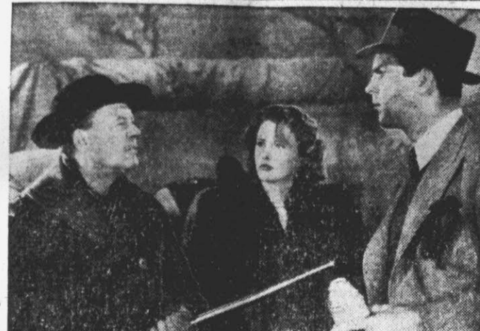
Pardon me—but you folks are trespassing! Scene from "Remember the Night" romantic comedy starring Fred MacMurray and Barbara Stanwyck opening tomorrow at the Pitt.

will sink back in their bog of inactivity. My opinion is, however, that the backlog of war business on hand will make 1940 a good year for these industries—with or without further large Allied orders. Decline Sooner Than Expected My outlook for the first half of 1940 called for the best six months' period since 1929, but at the same time for downward dips. The drop since the turn of the year came quicker and has been sharper than I anticipated, but the winter has also been more severe. Blizzards have tied up business from Hudson Bay almost to the Gulf of Mexico and from coast to coast. Nevertheless, business is still 14 per cent above a year ago which is in line with the 10 to 15 per cent gain that I predicted. Moreover, I agree with the summary of the Florida Business conference that the downturn should soon be halted and the background laid for renewed advance. The European situation and the uncertainty of our own political picture have given business men another attack of the jitters. When the current period of "watchful waiting" will end, no one dares forecast, but that it must end sometime everyone is agreed. When it does, it will sign off with just as big a bang as similar periods have finished up in the past. My message today, therefore, is: Do not be caught napping when the time to move comes. With business fluctuating in these short, sharp cycles, you must be ready to work fast when the business light turns green!