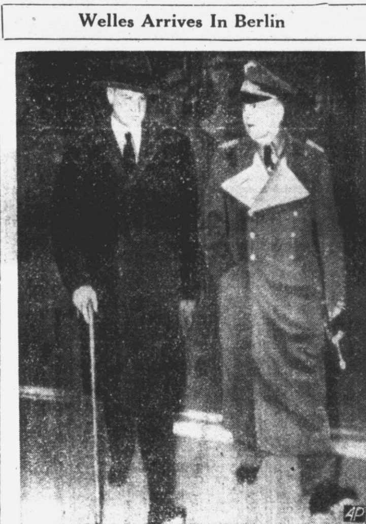
Welles Arrives In Berlin. Sumner Welles (left), President Roosevelt's fact-finding emissary to Europe's warring nations, is shown in this radiophoto as he arrived in Berlin. He is seen leaving the railway station with Baron Ernst von Weizsaecker, secretary of state in the German Foreign Office.