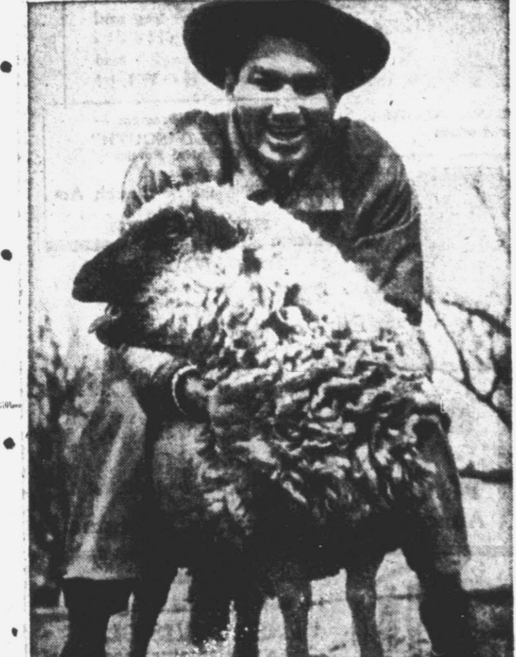
Dizzy Dean listening to the sheep and milking the cows down on his farm near Dallas, Tex., these days in preference to accepting a $10,000 contract to pitch for the Chicago Cubs. That sum is far below the big money Diz once drew. And what's more, it's the only offer that's come to him for the 1940 season. But Diz says he's more interested in farming at present.