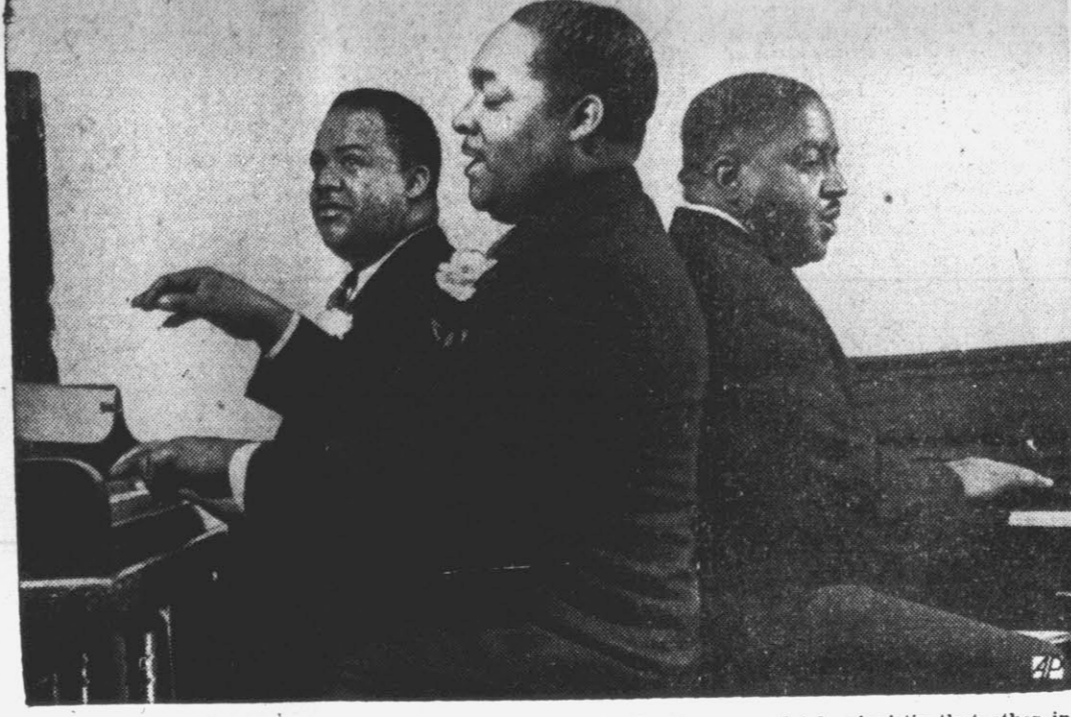
BOOGIE-WOOGIE—Swing of the future? This kind of swing is so completely pianistic that other instruments can hardly reproduce it. Players are Albert Ammons and Meade Lux Lewis on the left, and Pete Johnson on the right.

Two interesting lines of possible development are represented by Art Tatum, on the one hand, and Duke Ellington-Marc Blitzstein-Earl Robinson on the other. Using ordinary pop tunes as a basis, Tatum improvises jazz-quality variations whose complexity would do credit to Liszt. Tatum gives what he calls "concerts" in small cafes, and the people who come to hear him are as hushed as they would be in Carnegie Hall. Music lovers chatter about the fact that Debussy, dissatisfied with prevailing systems of harmony, invented his own. Yet few Americans have paid any attention to Duke Ellington, who also perfected his own harmonics. Duke's stuff has "rock" and is hot in the best jazz manner but at the same time it is rich and highly original. It re-