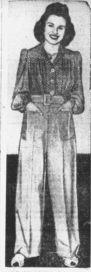
FOR LOUNGING —From California's fashion world come these tailored slacks of green linen-like rayon weave topped by a soft shirt of green and white polka dotted crepe for lounging.