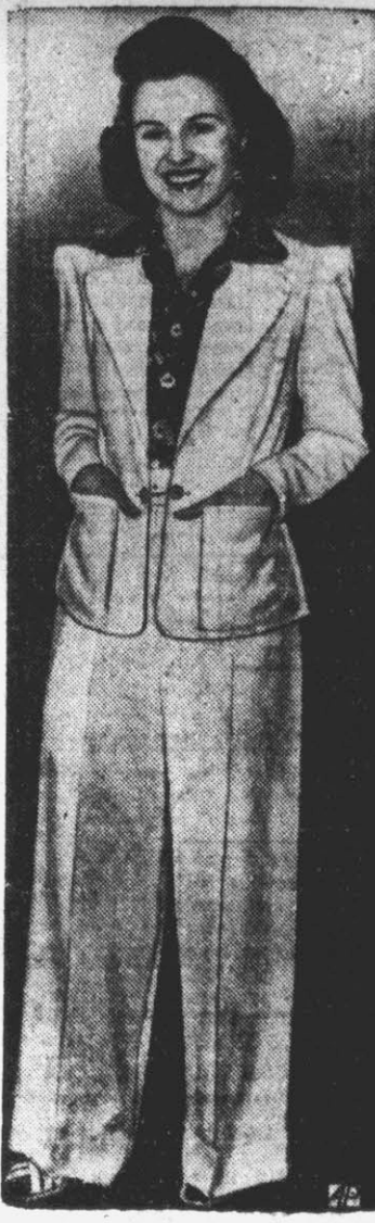
FOR COUNTRY —Designed for racing around the countryside is this suit. It combines slacks and jacket of natural colored rayon weave and a printed blouse. Notice the big pockets.

Which made another interesting feature of the collections, were softened versions of the shirt-waist dress, designed with skirts having easy fullness. Because so many California women drive cars bodies were designed with soft gathers or reversed pleats that gave action play both to front and back. Nearly all had some colorful striking accent.