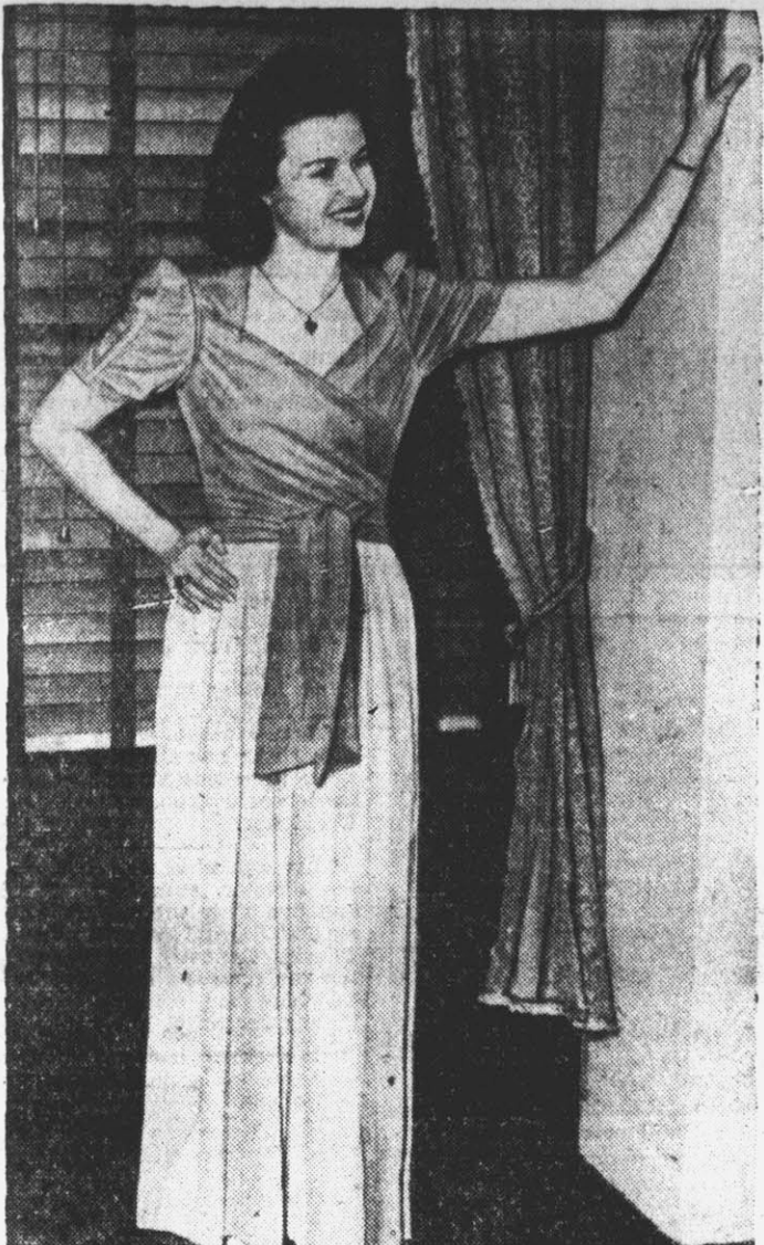
FOR PARTIES —These trousers are designed for dinner. They are of turquoise rayon jersey, topped by a coral bodice of the same fabric. All designs by Viola Dimmitt.

Which made another interesting feature of the collections, were softened versions of the shirt-waist dress, designed with skirts having easy fullness. Because so many California women drive cars bodies were designed with soft gathers or reversed pleats that gave action play both to front and back. Nearly all had some colorful striking accent.