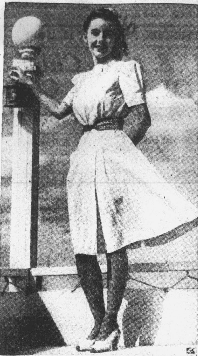
As a grace note for the awkward are an American designer makes this round-necked frock of white rayon sating. It's buttoned down the back to the waist and cinched with a broad belt, criss-crossed with red, blue and white cotton skeins.