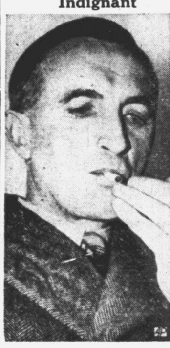
Liam O'Flaherty, Irish writer shown as he arrived in New York, voiced indignation over the execution by English authorities of two alleged Irish Republican army terrorists. He predicted that within the next twelve months the six northern counties of Ulster would be absorbed by Eire.

fare. However, there is reason to believe that the Chinese will launch a counter-attack against Nanning; in that case I hope to journey southward and really see some fighting. On our trip to Changsha we travelled by air—to Keilin in Kwangsi province—thence by train to Hengyang in Hunan, then by car, train, and steam launch to Changsha. From there we had a four-day walking trip to battle fields; sometimes we rode sedan chairs, once ponies. Practically every known means of communication! The train incidentally was about the best I had ever ridden on. The sleeping cars were Belgian-made wagon-lits."