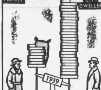
Each Coin = $25 of Income

The scales show the farmer's income as compared to the city man's: (1) In 1912, when government economists figure the farmer had his full normal share of the national income; (2) in 1932, when he had only 1-3 of his normal share; (3) in 1939, when he had 73.5 per cent of his share. The farmer never has to get the same number of dollars as the city man to get his normal share of national income. This is because the farmer gets some food, clothing, etc., for little or nothing. This part of his income is represented by the sacks of grain.