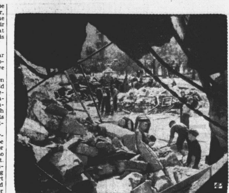
Terrribly destructive air raids helped crush Poland. This is a scene in Warsaw.

order fundamentally. The nobility gave the people a constitution, although they kept the emperor cleverly immune to man-made laws. One of their houses of Parliament was even named "House