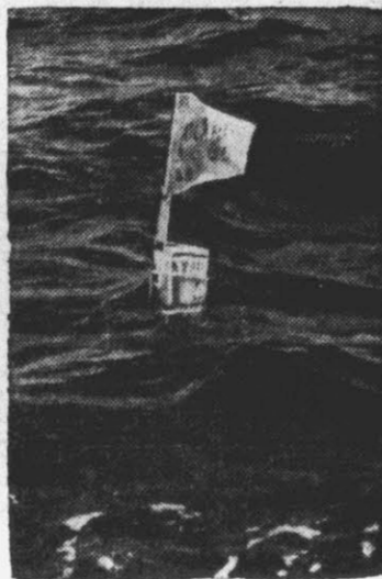
Atlantic Mail, Ahoy!

AP Feature Service Miami Beach, Fla.—Many a fishing cruiser captain off Miami Beach acts as an unofficial mailman these troubled days at sea. The cruiser skippers keep a sharp lookout, not only for fish, but also for tiny buoys carrying the "Atlantic mail." Merchant seamen, some of them homesick American sailors, place their letters in tin cans, seal the receptacle with wax, weigh them with scrap iron, attach white flags, and toss them overboard in the hope they will be picked up off-shore and mailed home. Some of the letters are sent by seamen aboard freighters from beligerent nations, men who hope that their messages will reach relatives at home. "Atlantic Buoy No. 18," picked up by Captain John Cass of the fishing cruiser Dolphin after the can had been floating four days, contained 32 Christmas greetings. It's pictured here.