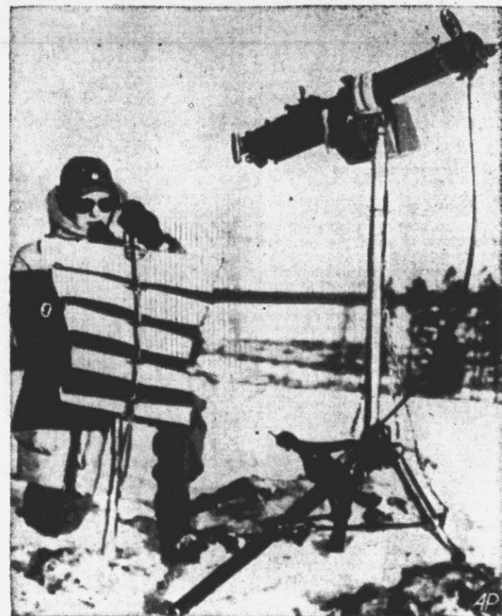
This Swedish soldier is typical of Swedes who have gone to fight for their neighboring Finland. This member of an anti-aircraft gun unit is shown on maneuvers in Sweden. Four groups of Swedish volunteers have gone and joined up with the Finns and Danish volunteers are on their way.