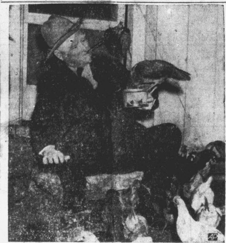
While talk of the presidential campaign goes on elsewhere, Vice President Garner is shown above feeding his bantam chickens, a chore he performs thrice daily while at his Uvalde, Tex., home during the winter months. The chickens are a favorite hobby with Mr. Garner and they, too, seem to enjoy the visits.