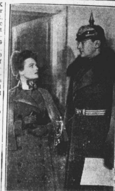
Scene from stirring screen drama "Nurse Edith Cavell" with Anna Neagle in title role at the Pitt today.

A. C. I. 25 Amcora 31 1/2 American Radiator 10 1/2 Bethlehem Steel 81 1/2 Chrysler 84 1/2 C. I. T. 122 1/2 Coca-Cola 46 Commercial Credit 46 Commercial S. Inv't 12 1/2 Consolidate Oil 7 1/2 Continental Can 42 Electric Bond and Share 8 General Motors 53 1/2 Gillette 6 1/2 International Telephone 41 Loblitz 23 1/2 Nash-Kelvinator 16 1/2 National Dairy 16 Ox-Steel 12 Packard 3 1/2 Paramount Pictures 8 1/2 Pullman 33 1/2 Pure Oil 9 1/2 Radio 5 Reynolds 40 Simmons 23 1/2 Southern Railway 19 1/2 Standard Brands 122 1/2 Sperry Corporation 45 1/2 Texas Corporation 46 Texas Gulf Sulphur 34 1/2 United Aircraft 45 1/2 United Corporation 2 1/2 United Drug 5 U. S. Steel 67 1/2 Warner Pictures 4 1/2 Western Union 26 1/2 Douglas Aircraft 70 1/2 N. Y. Central 18 1/2