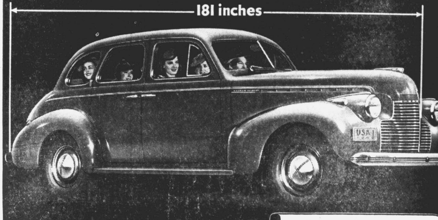
The Master 85 Sport Sedan, $740*

Among the Lowest-Priced Cars , Here's "THE LONGEST OF THE LOT!"