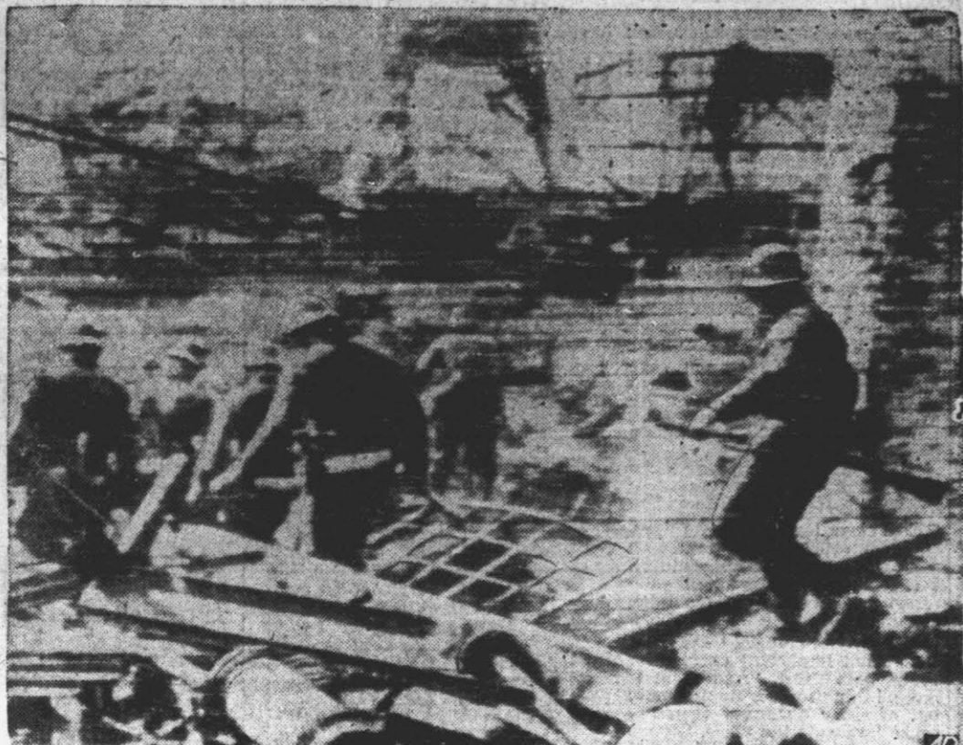
This radiophoto, according to the caption passed by the Berlin censor, shows German soldiers searching the ruins of Westerplatte, the Polish ammunition dump near Danzig which the Poles finally surrendered after a gallant defense that won the admiration of the Germans and the world. Armed only with machine guns, the small Polish garrison withstood terrific bombardment from sea and air and fought off the attackers for days.