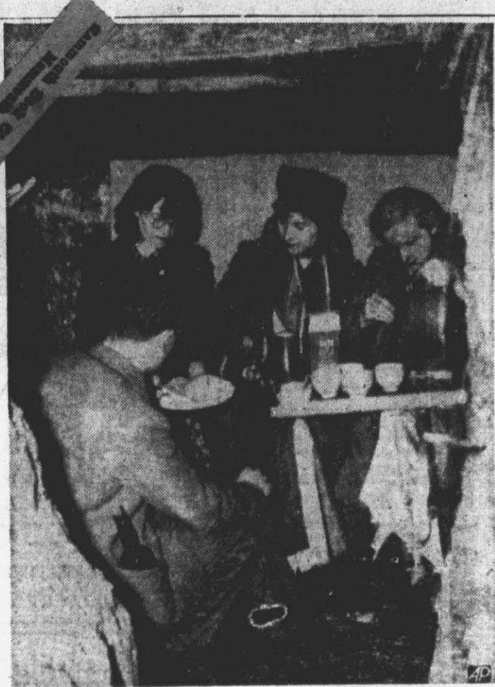
Here's how thousands of London residents eat breakfast when air raid warnings sound early in the morning. They are dining in the family dugout which in this case happened to be in the garden. And always gas masks are kept in handy places. The bottle in the pocket of the man of the family seems to indicate he believes in having a bit of stimulants handy, too.