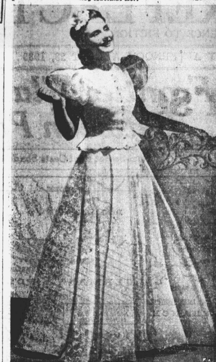
Looking for a frock that will go to dinner as well as to a dance? Here is one of crisp, white, floral bow-knot organdie designed with a full frothy skirt. Under the puff-sleeved jacket is a simple bodice with a scalloped top.

When putting salad dressing or mayonnaise on sandwiches see that it is thick enough not to run out the sides. To deep-fry, select a flat bottomed pan and fill it not more than two-thirds full of fat so that none will splash out and cause fire. Heat it slowly. Fat is hot enough for fritters, doughnuts and other batters when it browns a cube of bread in 60 counts. If it browns in 40 counts the temperature is right for croquettes and other cooked foods. Never heat fat until it is smoking. Try cooking your jams and butters in the oven instead of on top of the stove. You'll avoid a lot of spattering. Put them in a wide kettle or earthenware dish and bake them at a moderately slow oven until they are thick. They'll require less water than when cooked on top of the stove. Stir them a few times with a long-handled wooden spoon.