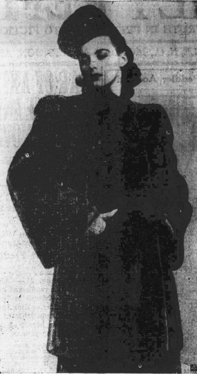
For both town and country wear an American designer makes this coat of safari brown Alaska sealskin cut on boxed lines. The small roll collar, squared shoulders and large sleeves are all indicative of 1940 trends.