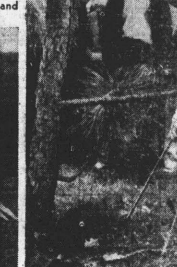
TRouble comes even to the champions: Picard tackles a tricky shot out of the rough.