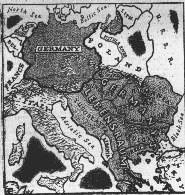
Shaded area, says Germany, is her living-room

Berlin.—(AP)—The word "lebensraum"—a Nazi creation—has been taken over into the English language and into other languages, yet the word does not appear in German dictionaries.