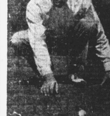
HENRY is 31 years old, 6 feet tall and weighs around 170 pounds.

HENRY PICARD finally broke through. He's the new Professional Golf champion. Five years ago he set a record by busting par in 50 of 54 tournaments. His pro pals knew he had the game to win any crown. Every year he was a serious threat in the National Open and the P.G.A. but his July triumph in the Professionals' championship brought him his first major title. He's won more assorted tournaments than any other golfer this year and tops the money winners with $8,177.