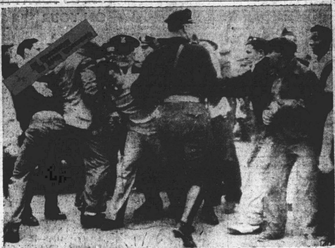
Fighting broke out between policemen and CIO pickets at the gate of the Fisher Body plant in Pontiac, Mich., when non-striking workers attempted to pass through the picket lines and enter the factory. Officers and pickets are shown shoving and tugging at each other. It was the second day of rioting.