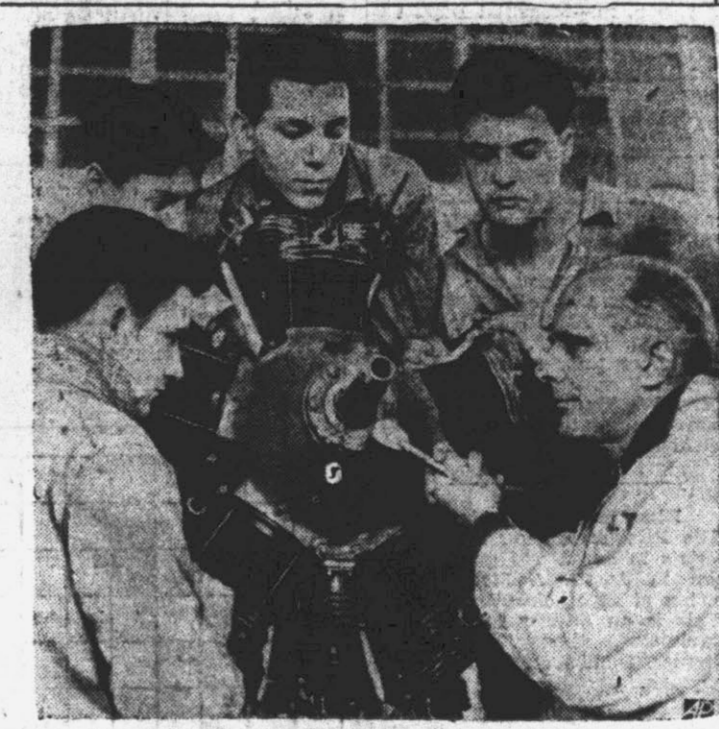
Gen. Umberto Nobile (right), an Italian airplane designer who twice skipped dirigibles across the North Pole, has come to the United States to teach American student-pilots. This fall he'll teach aerodynamics and mathematics at the Lewis Holy Name School of Aeronautics in Lockport, Ill., where he's shown. His only close relative, a daughter, 21, will join him soon.