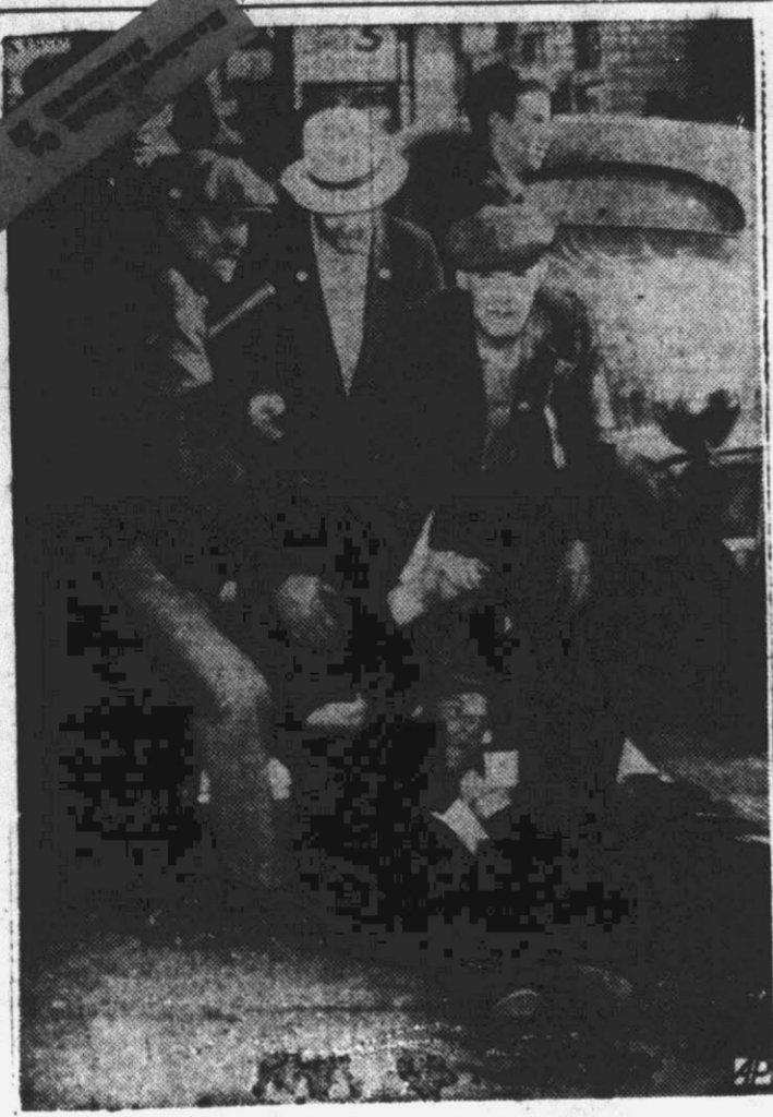
Lying on the sidewalk is one of several men wounded in a fight between rival unionists near the Fisher Body Plant No. 1 at Flint, Mich. Fellow union members are helping him to his feet while police quell the disturbance. The combatants used fists and clubs. One faction belongs to the CIO and the other to the American Federation of Labor.