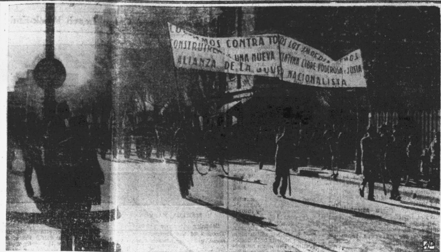
'WE WILL FIGHT ALL IMPERIALISM' reads sign carried in recent Buenos Aires parade of the Alliance of Nationalist Youth (Alianza De La Juventud Nacionalista). Observers say Fascists support group. Marchers promise to "build a new Argentina."