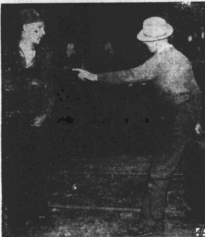
It looked like trouble for a few moments when this union picket and a worker met in one of the soft coal fields of "Bloody Hartan" county, Ky. The picket holds a rock behind his back, the worker reaches inside his shirt.