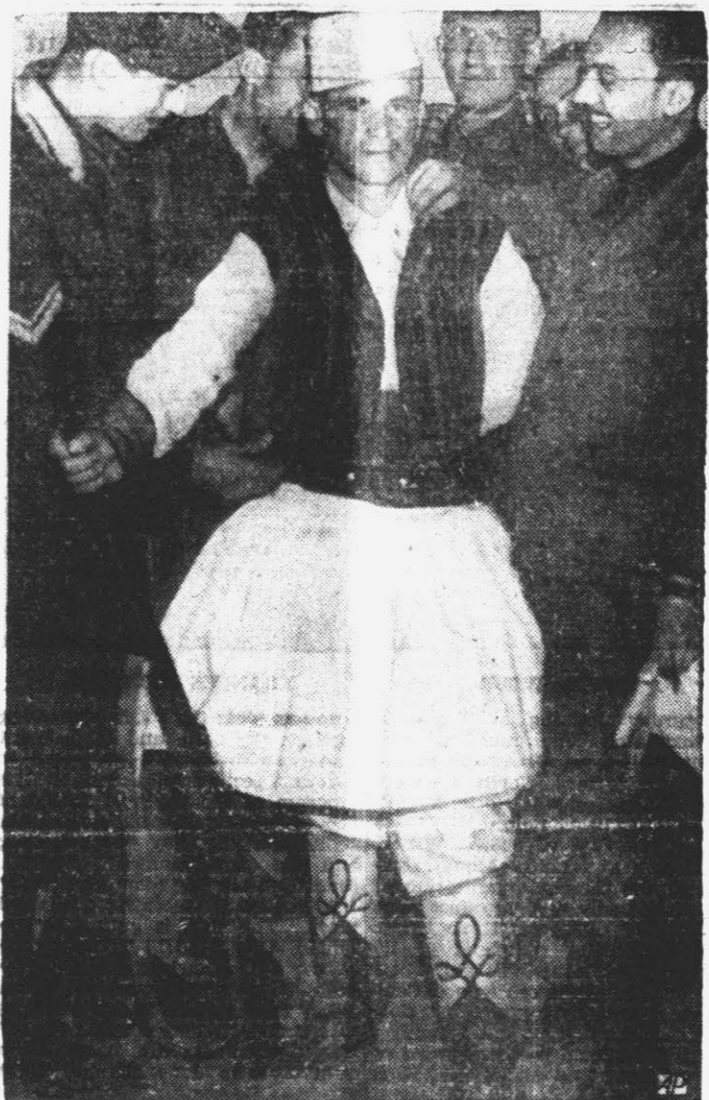
UNDER NEW MANAGEMENT, this and other Albanian soldiers who had a country of their own before "Good Friday," April 7, 1939, when Mussolini's legions took over Albania's 10,629 square miles, recently visited Rome. There, Italians found amusement in the traditional skipper uniform. Soldiers of the former royal Albanian guard took oath in Italy's army.