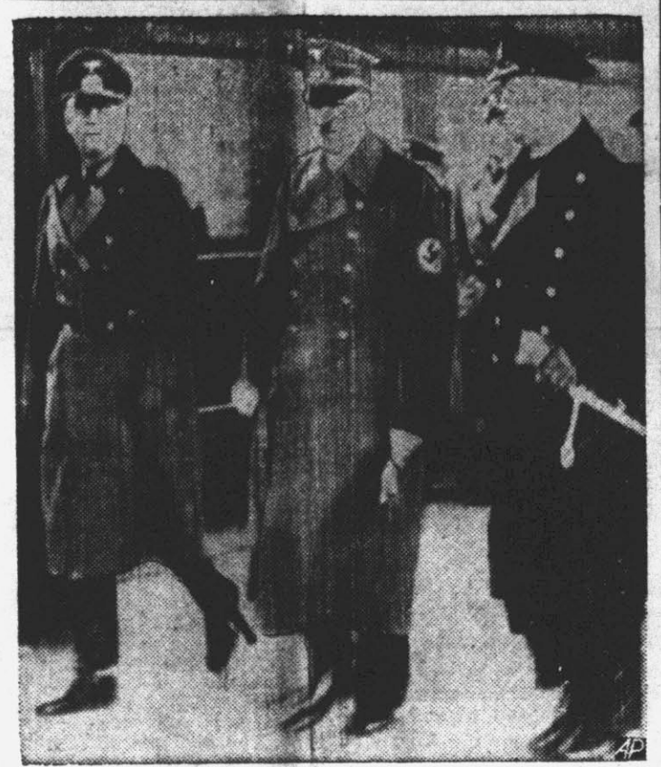
In this radiophoto Germany's Dictator Adolf Hitler (center) is shown at Berlin as he prepared to depart to board the battleship Deutschland which carried him to Memel, principal city of the latest territory to be incorporated into the German Reich. Shown with Der Fuehrer are Wilhelm Keitel (left), chief of the high command of Germany's armed forces, and Erich Raeder (right), chief of staff of the German navy.