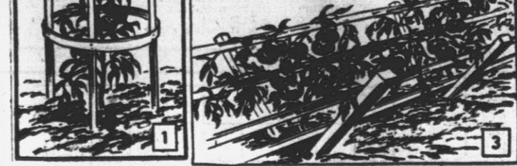
These three methods of staking tomatoes are used with success: 1. Four 2x2-inch stakes places around each plant are connected with barrel-hoops or twine; 2. High single stakes, at least six feet high, are used for single plants placed in next to the plants and slanted away from them and are connected by slats space nine inches apart.

Greens for Health. The person looking out for his health may take up gardening just for the exercise and the fresh air.