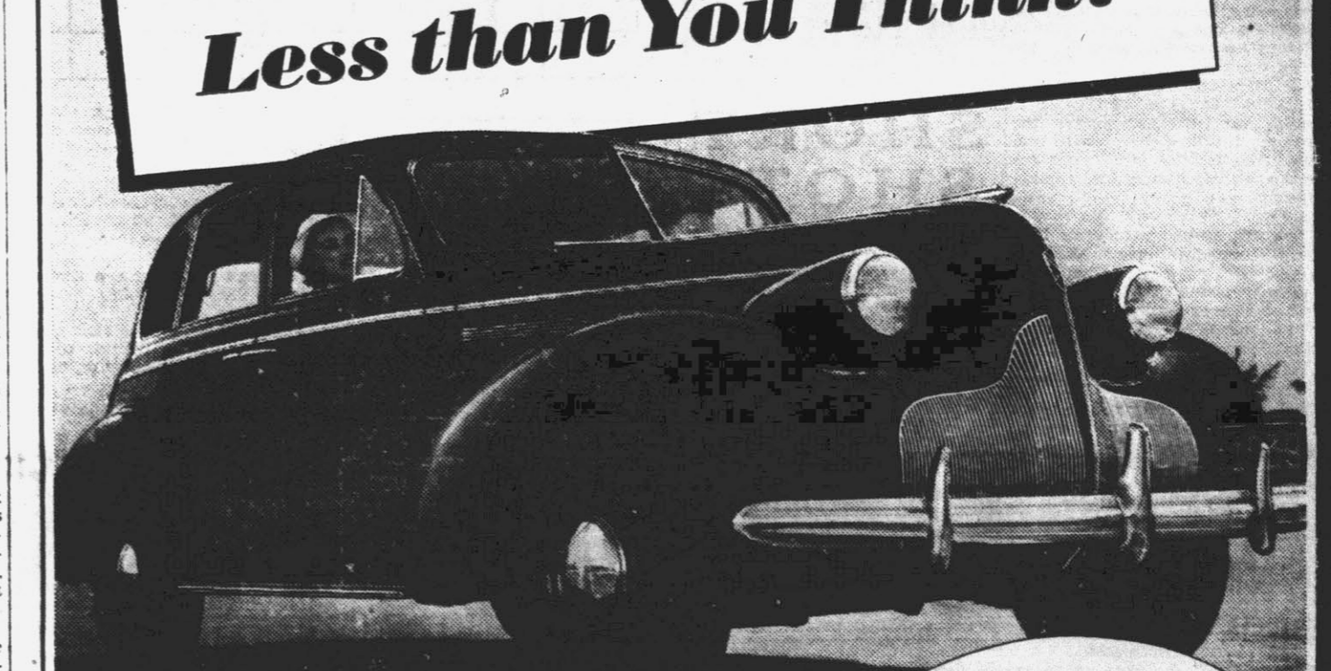
The model illustrated is the Buick Special model #1 four-door touring sedan $996 delivered at Flint, Mich.

What Price this Glory? Less than You Think!