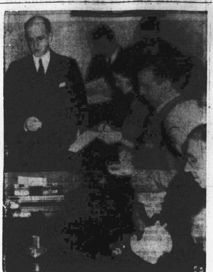
Summer Welles (left), acting secretary of State, is shown in his office at Washington as he made public to newspapermen the contents of the United States note to Germany on the Czech-Slovakian situation. The note said this government "does not recognize that any legal basis exists" for Germany's protectorate over Bohemia and Moravia, once provinces of the fallen Czech-Slovakian republic.