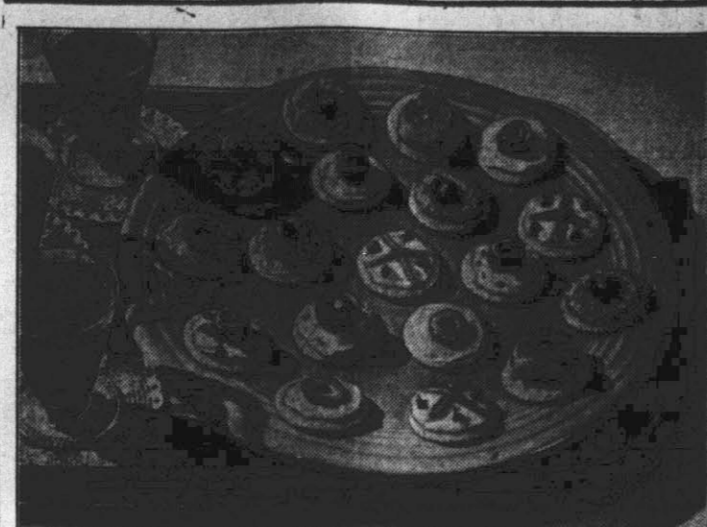
Gay Cracker Tidbits Can Be Served On a Dozen Different Occasions.

To begin the informal dinner—to serve as the main course of a smart little luncheon—to go with a cup of iced tea or tall frosty glasses at five o'clock parties, there is nothing more appropriate than a tray of gay tidbits and tempting appetizers.