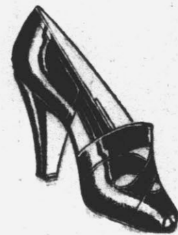
UPPER LEFT—Step-in with open toe. Black patent leather.