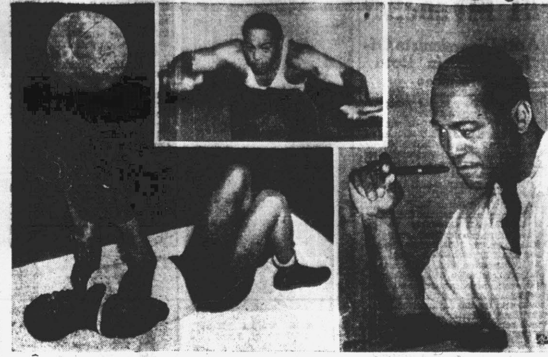
John Henry Lewis (Above) Comes From A Fighting Family