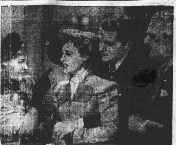
Florence Rice, Jeanette MacDonald, Nelson Eddy, Frank Morgan in a scene from "Sweethearts," current Pitt film.