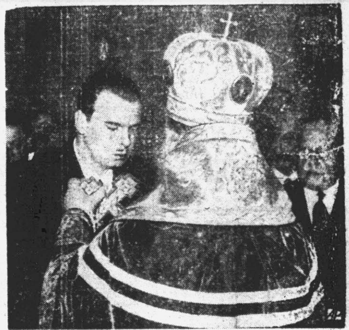
THRONE IN THE UKRAINE does not interest Grand Duke Vladimir (left), declared the 21-year-old pretender to czarship of Russia, shown at recent Paris ceremony proclaiming him czar. Speculation that Hitler contemplated installing him as a ruler of the Nazi-coveted Ukraine (now Russian territory) followed news that Vladimir was to visit in Germany.