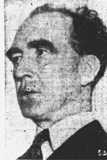
MOTHER'S BIBLE was used by Frank Murphy (above) in taking oath as new U. S. Attorney General. Mr. Murphy was formerly Governor of Michigan, where his methods of dealing with sit-down strikes became an issue in last election.