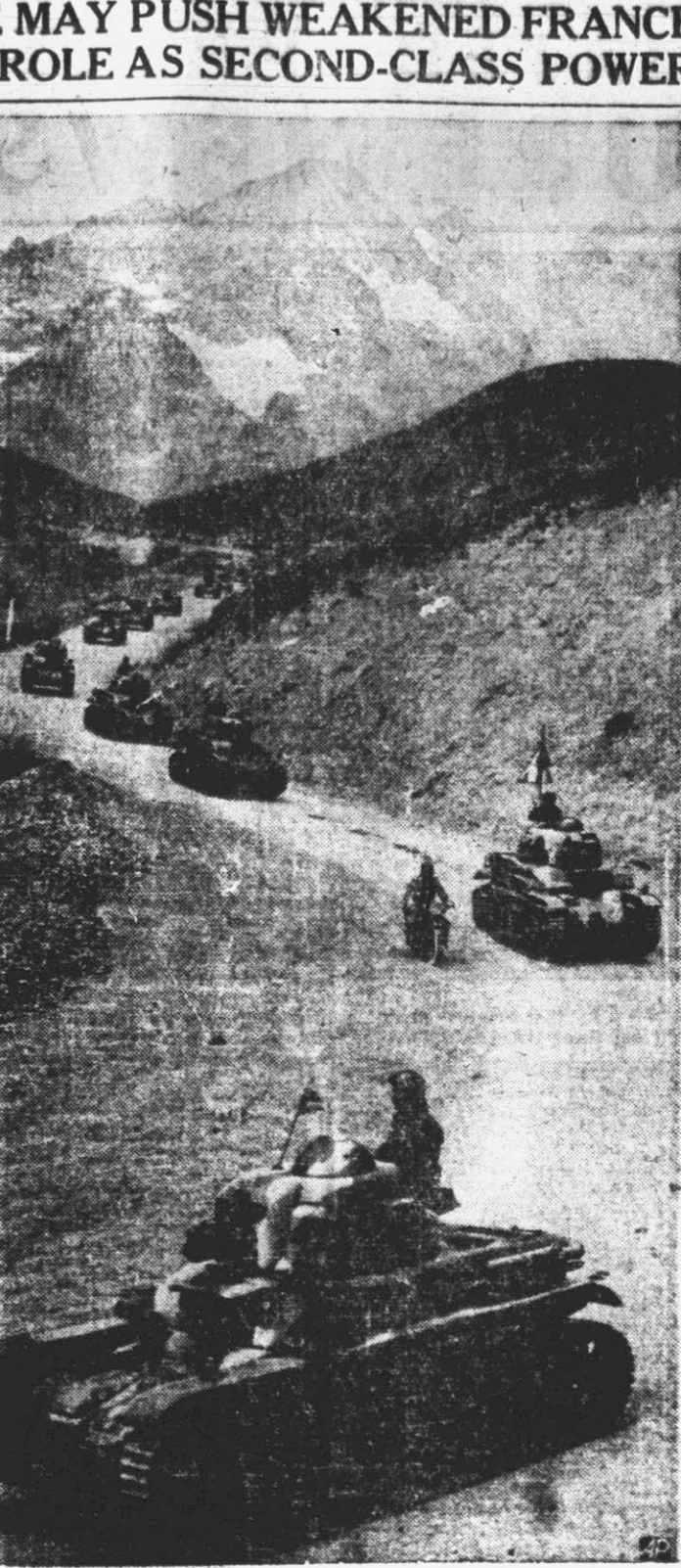
France's army on the ground, as exemplified by these tanks man- euvering in the Alps, is large and strongest. But reckoning armed's strength these days calls for a look at the air force.