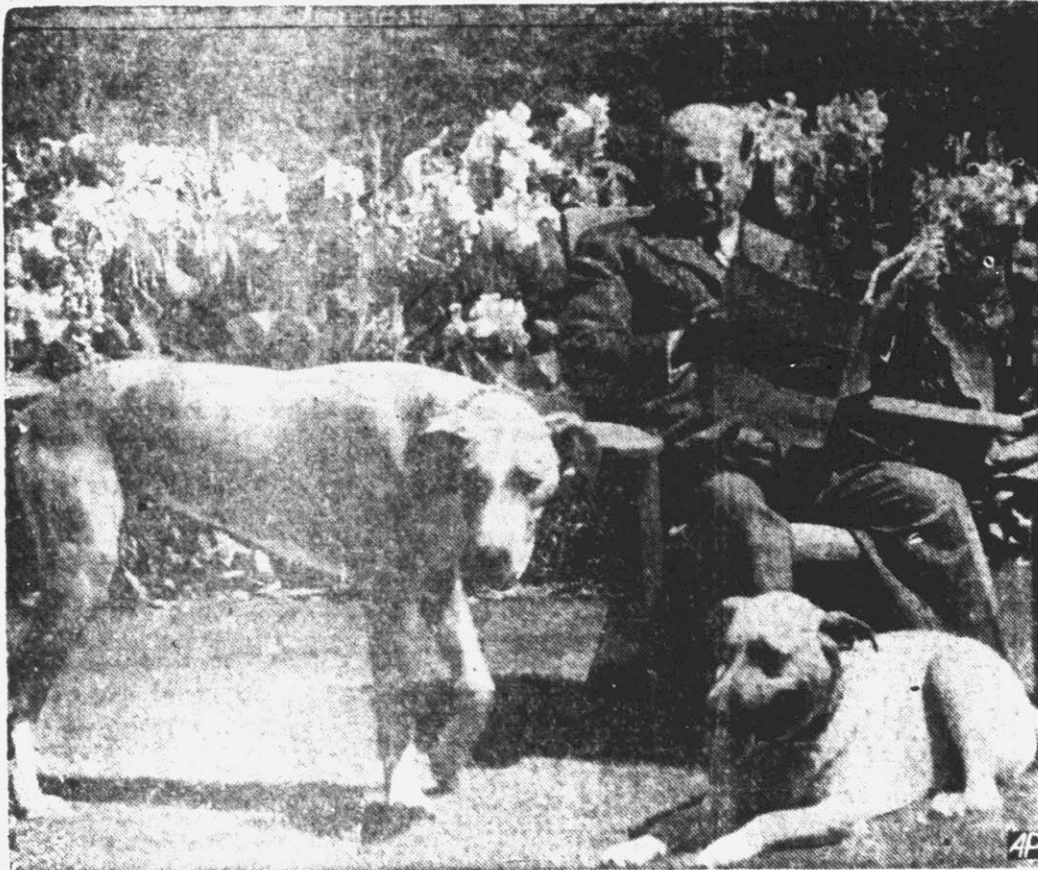
LIMA'S PLACE IN THE HISTORY BOOKS, as a result of the Pan-American conference welding 21 American republics in an aggression-resisting pact, will share space with Oscar Benavides, Peru president, shown in his garden. The pact is to safeguard the Americas against aggression. President Benavides' watchdogs are Dempsey and Firpo.