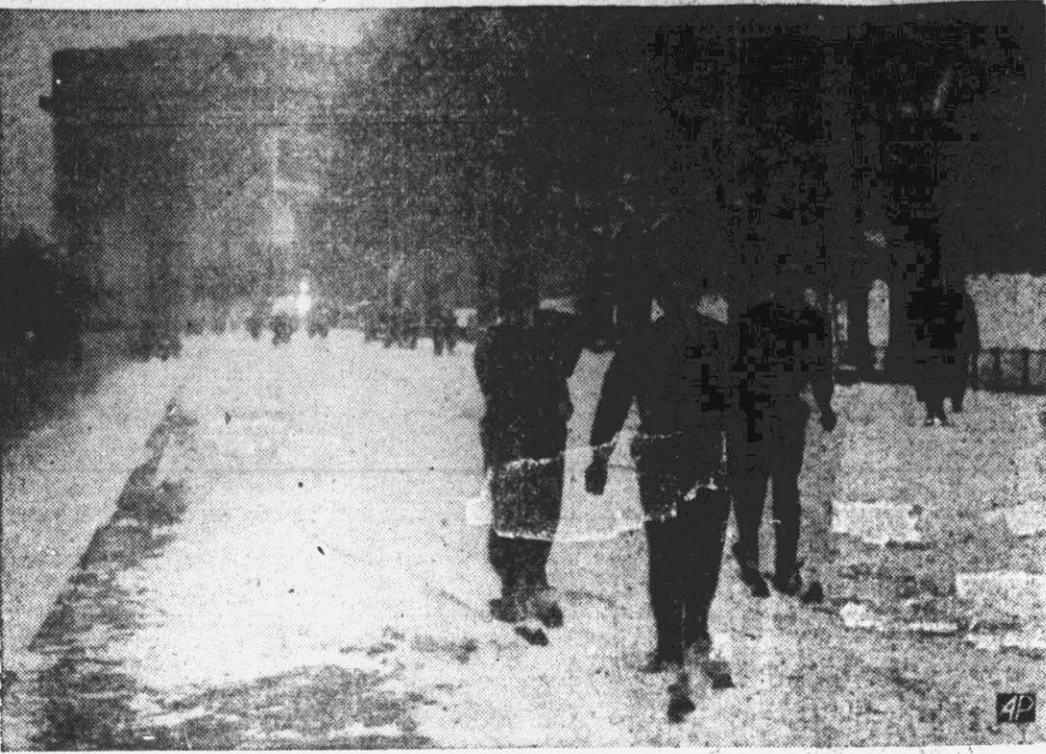
HERE'S ONE 'WET BLANKET' that heightened rather than dampened the fun. Recent heavy snow in Paris brought out these street skiers not far from the arch of triumph.