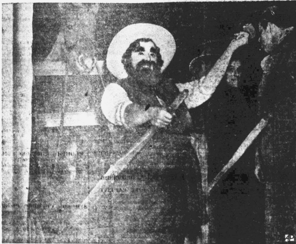
ENTER THE BEARDED LADY pulling a cart and pony. That beard hides Elsa Maxwell society's prime party-giver who staged a farm frolic at Pittsburgh for a hospital benefit.