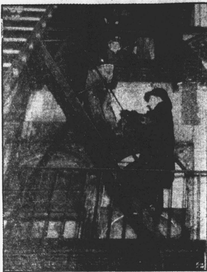
Firemen are shown removing the body of one of four persons who perished in a flames that swept a New York tenement house, trapping them on the upper floors. Several were saved in spectacular rescues and scores fled into the streets.