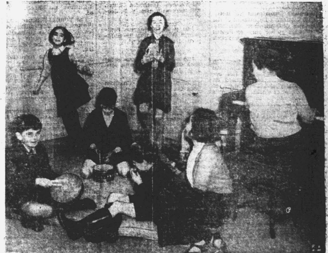
SEEKING PEACE FOR TROUBLED MINDS of children unable to adjust themselves to normal living, the British children's center of the institute of child psychology is constantly exploring the maze that is a human brain. Here are some of the young patients—difficult children with mental problems—expressing themselves as they choose while a staff member plays the piano.