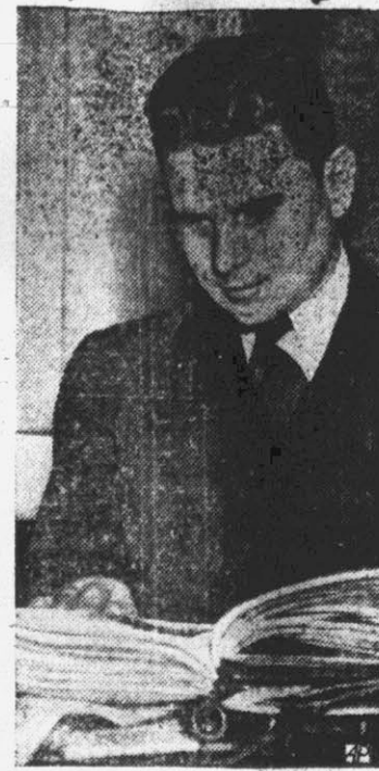
A STRANGER —yet, Albert Gore, a new Democratic congressman from Tennessee, looks over pictures of congressmen pasted in a book in the speaker's office for reference.