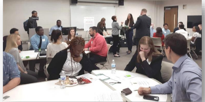
NCACPA's Student Speed Networking Event