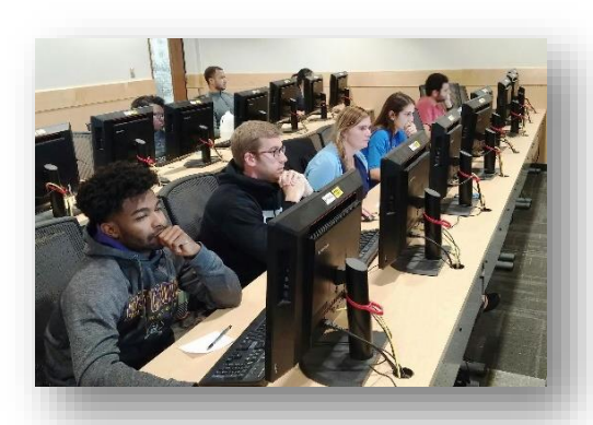
CPA Exam Field Test held in Bate Building