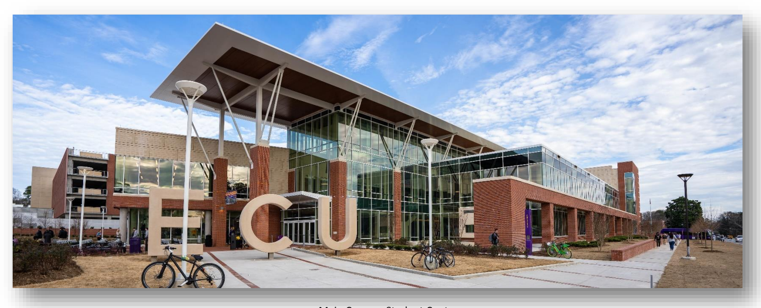
Main Campus Student Center 501 East 10<sup>th</sup> Street, Greenville, NC

For an online look at this beautiful new building, visit: https://studentcenters.ecu.edu/main-campus-student-center/