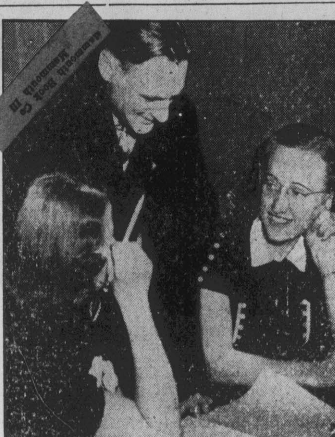
United States Senator Gerald P. Nye of North Dakota grins broadly as he watches his lead grow over that of Gov. William Langer in their race for the Republican Senatorial nomination.