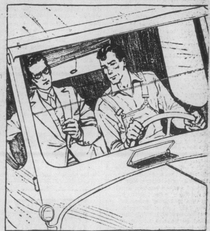
I'm blinked as the speedometer swung around the dial.

"I wish I knew!" Asey said. "I wish I knew!" As he went out on the back porch, Tim Carr drove up in his little coupe.