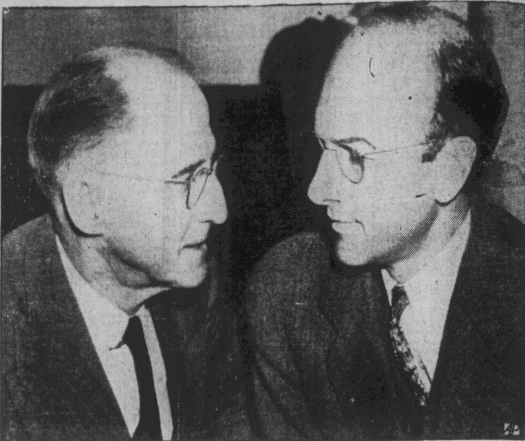
Harcourt Morgan (left) and David E. Lilienthal, directors of the Tennessee Valley Authority, are shown in Washington, D. C., as they held a last minute conference before taking the stand before a joint congressional investigating committee to tell their side of the long-developing quarrel over the agency's operation. Lilienthal testified that Arthur E. Morgan, former TVA chairman, tried to "defeat and obstruct the authority" in litigation involving its constitutionality.