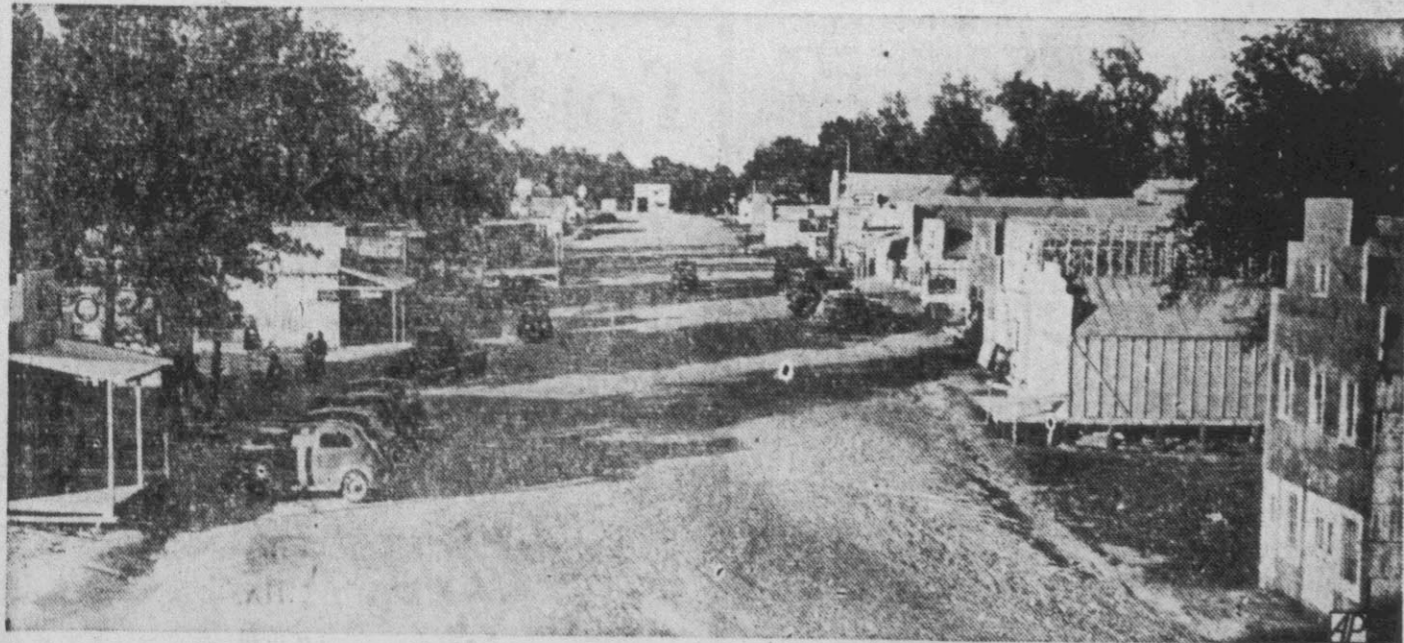
BOOM DAYS IN DISNEY, OKLA., haven't ignited the town's Main street yet (above), but wait and see—says this community springing up beside federal $20,000,000 Grand River dam project.