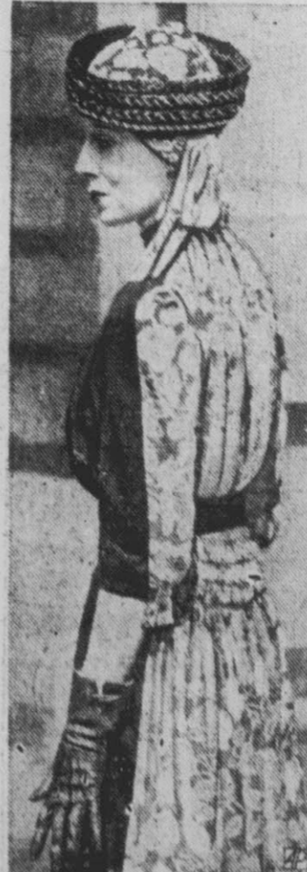
'ALF and 'alf made whole gown for this London lady.