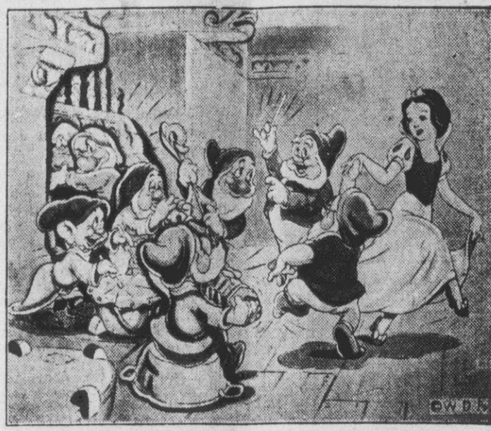
All seven—count them! Walt Disney's Snow White and the Seven Dwarfs, opens a four-day engagement Thursday at the Pitt Theatre.