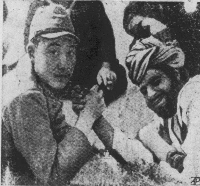
BEST HAND WINS in Oriental game, "Hands," being played by a Japanese soldier and an Indian Sikh, both off duty. The idea is to force the opponent's forearm and hand to the ground. It's a familiar sight in the park at Shanghai.