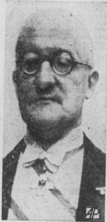
STERN-FACED Dr. Herbert von Dirksen (above) is the new German ambassador to London, where he recently presented his credentials to King George. Formerly at Tokyo, von Dirksen succeeds Joachim von Ribbentrop at London Embassy.