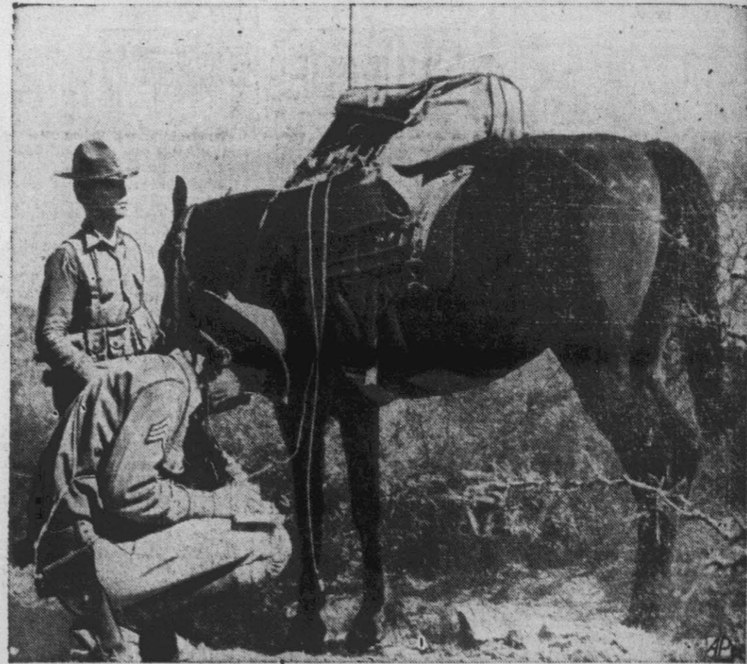
MARS WAS TUNED IN when almost 4,000 men and officers of the First Cavalry division staged war drill in the Big Bend country of West Texas near Balmorhea. A radio system with the Big Bend country of Texas. This general scene shows where the soldiers lived when they weren't urging their horses over dusty trails, learning military strategy in the rough country.