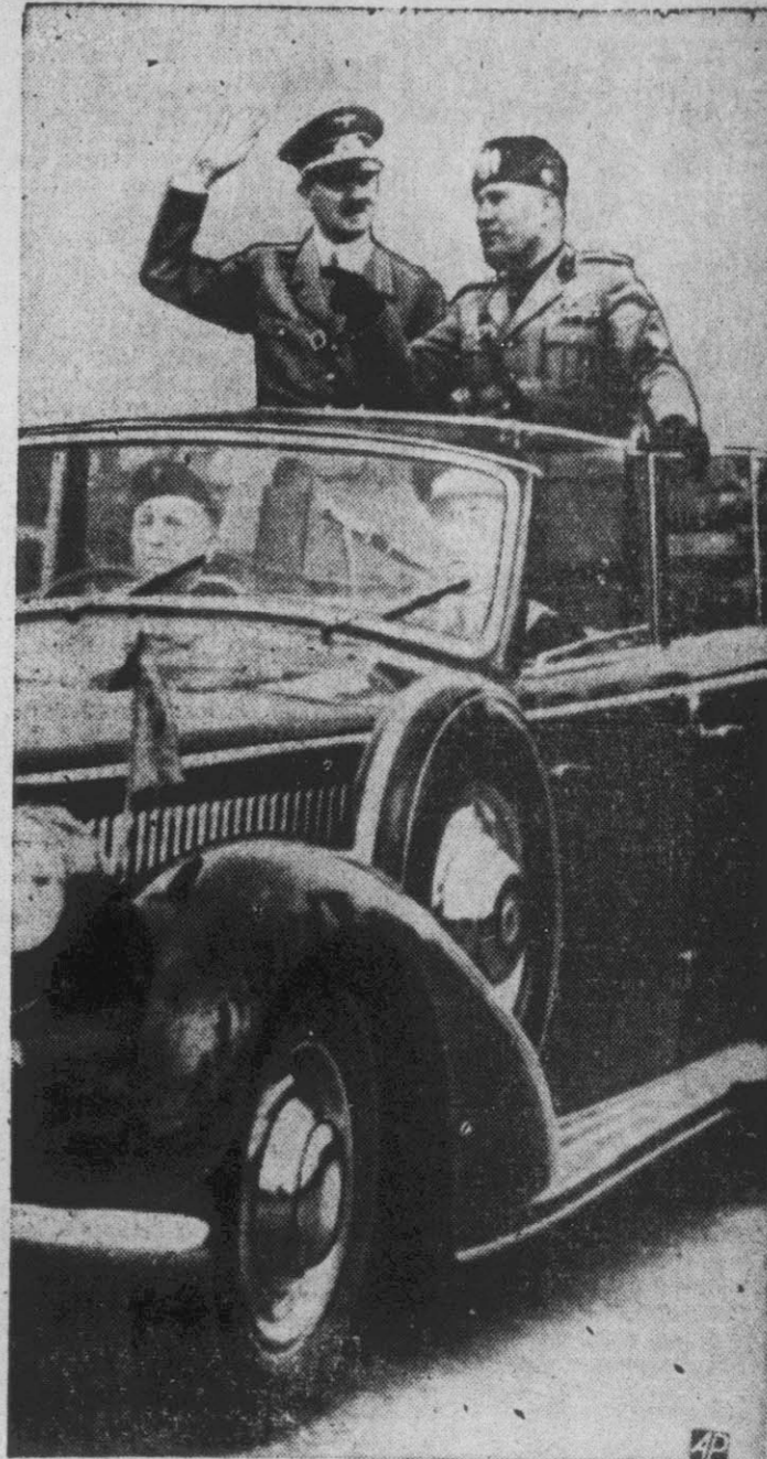
DUCE POINTS WITH PRIDE but Hitler (left), busy with answering "hell" for crowds, looks elsewhere in this view of Mussolini and Hitler, taken during German chancellor's visit to Rome. Soon after this historic meeting, Il Duce publicly condemned U. S. failure to recognize Ethiopian conquest, warned the democracies against a future war with totalitarian states.