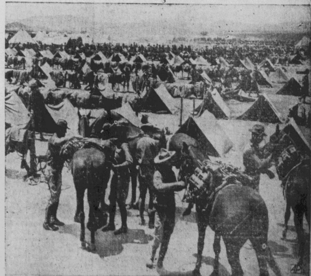
IN TEXAN HILLS A TENT CITY sprang up overnight to shelter men of the First Cavalry division when 3,947 men and more than 4,000 horses engaged in war maneuvers in the Big Bend country of Texas. This general scene shows where the soldiers lived when they weren't urging their horses over dusty trails, learning military strategy in the rough country.