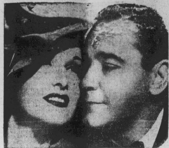
Gail Patrick, Herbert Marshall provide the romantic interest in "Mad About Music," starring Deanna Durbin, and opening Sunday at the Pitt.