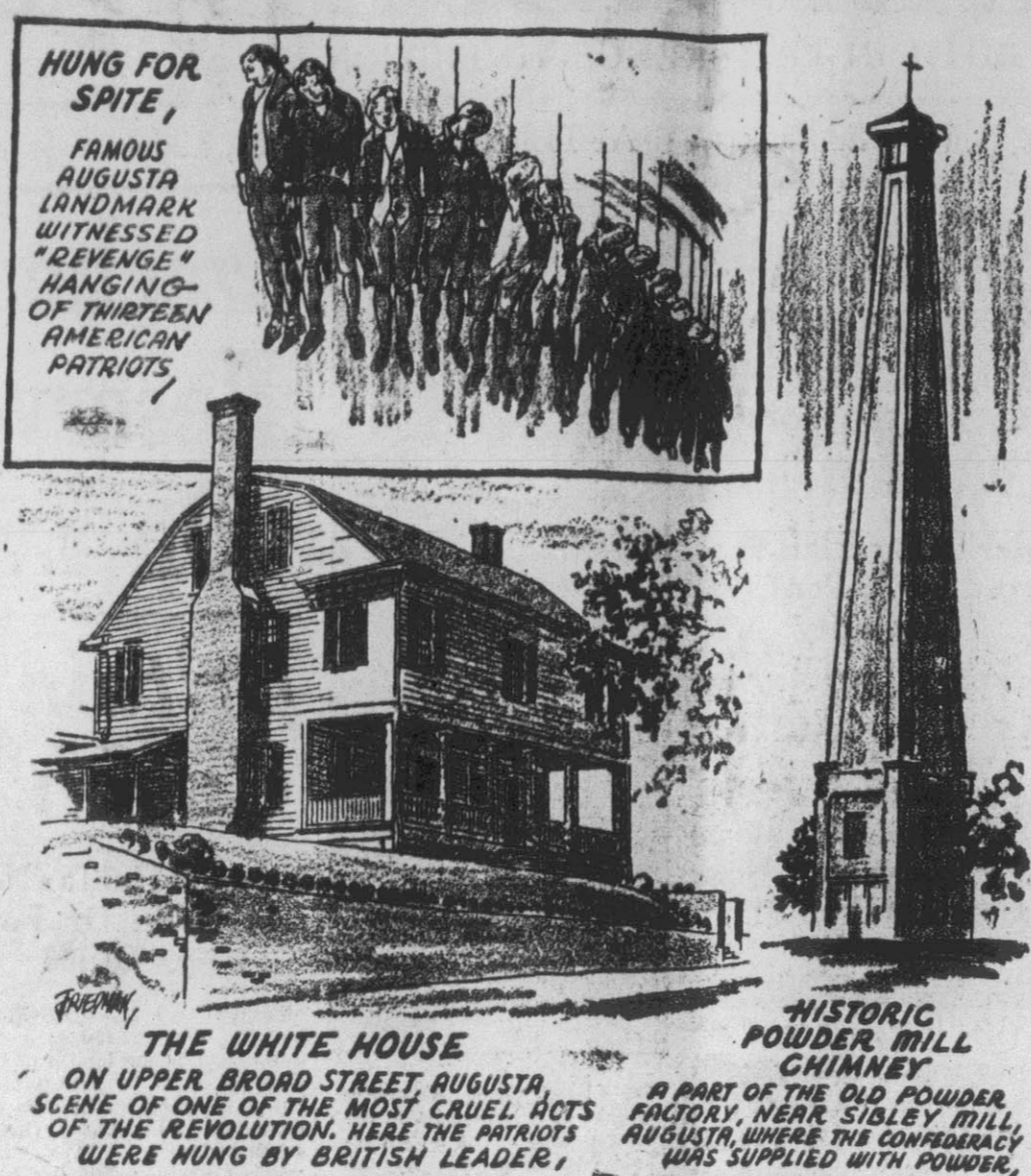
THE WHITE HOUSE ON UPPER BROAD STREET, AUGUSTA, GEORGIA, SCENE OF ONE OF THE MOST CRUEL ACTS OF THE REVOLUTION. HERE THE PATRIOTS WERE HUNG BY BRITISH LEADER.