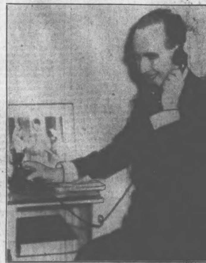
Frank Murphy, high commissioner to the Philippines whom President Roosevelt granted a leave of absence, is shown here in telephone to returns that elected him Democratic governor of Michigan over the Republican incumbent, Frank D. Fitzgerald.