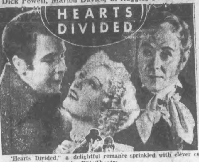
'Hearts Divided,' a delightful romance sprinkled with clever comedy, opens Monday at the Pitt Theatre.