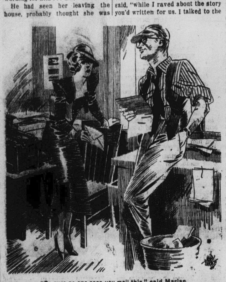
"Be sure no one sees you mail this," said Marian.

CLOSE TONIGHT Registration books for the coming November election close tonight and if you are a resident of Greenville or Chicod Townships and have not registered you must do so tonight or you can't vote in the election. Because of the division of these two townships into new voting precincts an entirely new registration was ordered and no matter how long you have been voting it is necessary that you be registered on the new books if you are to vote in November. We again call the matter to your attention at this late hour, hoping that some of you who have not registered will do so tonight, for certainly it is your duty and to be sure you want to have a part in the election in November.