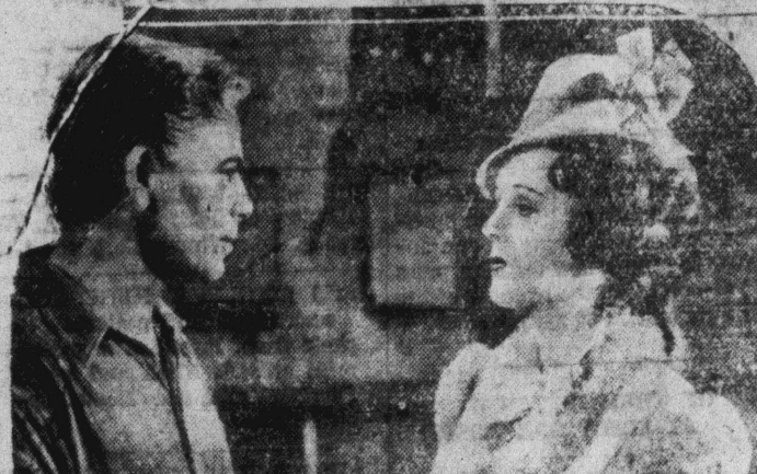
Paul Muni and Mary Astor are seen together in "The World Changes," Muni's latest hit, here Thursday.