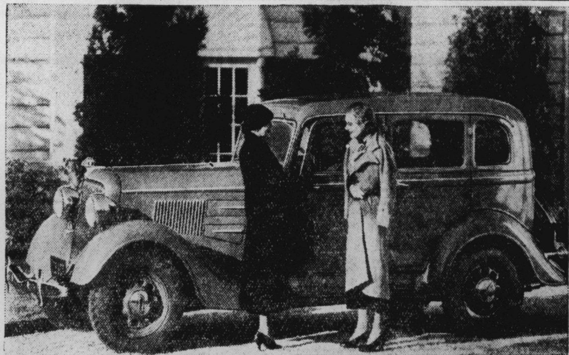
DE LUXE PLYMOUTH SIX... America's biggest low-priced car.

COME SEE... The Only Low-priced Car with Individual Wheel Springing plus... Floating Power... Safety-Steel Body... Hydraulic Brakes