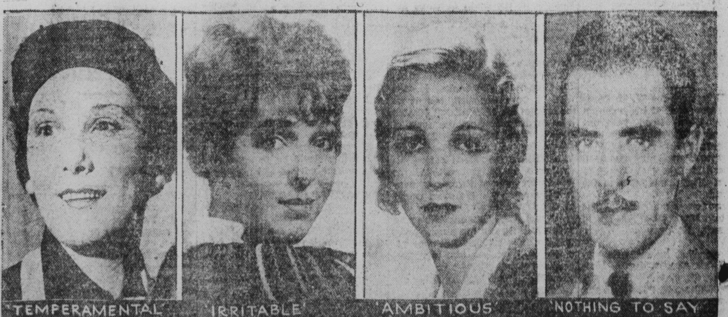
Hollywood is puzzled. Why have the four marriages of John Gilbert, one of the screen's most noted lovers, ended in failure? Two of his ex-wives and the one he now has separated from offer some of the reasons. "He was too temperamental," says Leatrice Joy (left). "He was irritable and moody," says Ina Claire (second from left). "He is a victim of his own driving ambition," says Virginia Bruce (third from left), his latest wife. And to those comments Gilbert replies, "There isn't anything for me to say."