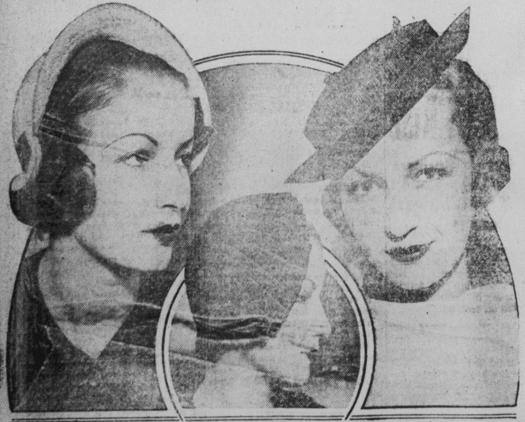
The hats that will be worn this spring are away off the face and very new in design. Here are three models designed by Lilly Dache. At the left is a dusty pink "Madame Bovary" bonnet. It sits far back from the face. A facing of black belting ribbon forms a soft line under the brim and ends in two perky bows at the side. In the center is a "windblown" beret in homespun straw cloth. A pleated flange faced with red and green belting ribbon dips low on one side. The other side is exposed. A nautical number is at the right. It is a Breton sailor in black straw cloth. It tilts saucily on one side.