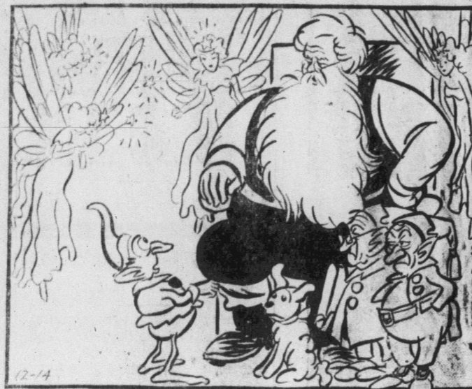
A little brown elf stepped up and tugged at Santa's boot.

There was great excitement in Toyland. You remember, a little which had stolen the pretty rag doll Christina. The two had disappeared up the chimney in a cloud of smoke. The tiny fairies tried to follow, but the fire on the hearth singed