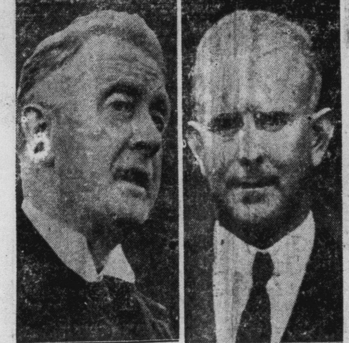
Allied in opposition to the De Valera administration in the Irish free state as co-leaders of the United Irish party are ex-President William T. Cosgrave (left) and Gen. Eoin O'Duffy, leader of the "blue shirts," a uniformed organization which has been outlawed. O'Duffy is a fugitive from a government warrant, and Cosgrave was shot at from ambush. The whole country is reported tense.