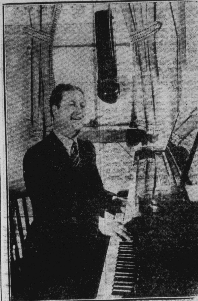
GENE AUSTIN, the real Father of Crooning, develops a new school of music for which he wants a name. It's sort of a half-way between crooning and jazz, a New Deal in stepped-up rhythm that sets feet and hearts tingling. He's at the State Monday, matinee and night.