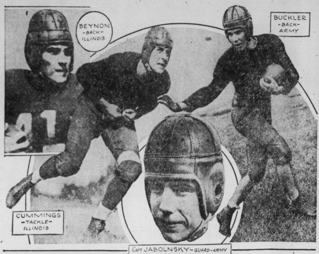
One of West Point's rare football excursions to the midwest will take the cadet gridders to Cleveland October 21 to meet Bob Zuppke's revived University of Illinois team in an intercollegiate headliner.