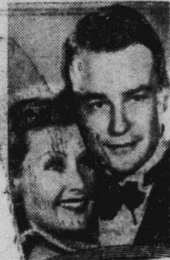
Lillian Harvey and Lew Ayes in "My Weakness," Monday-Tuesday.