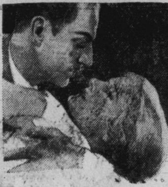
Wm. Powell and Ann Harding in "Double Harness," Friday.