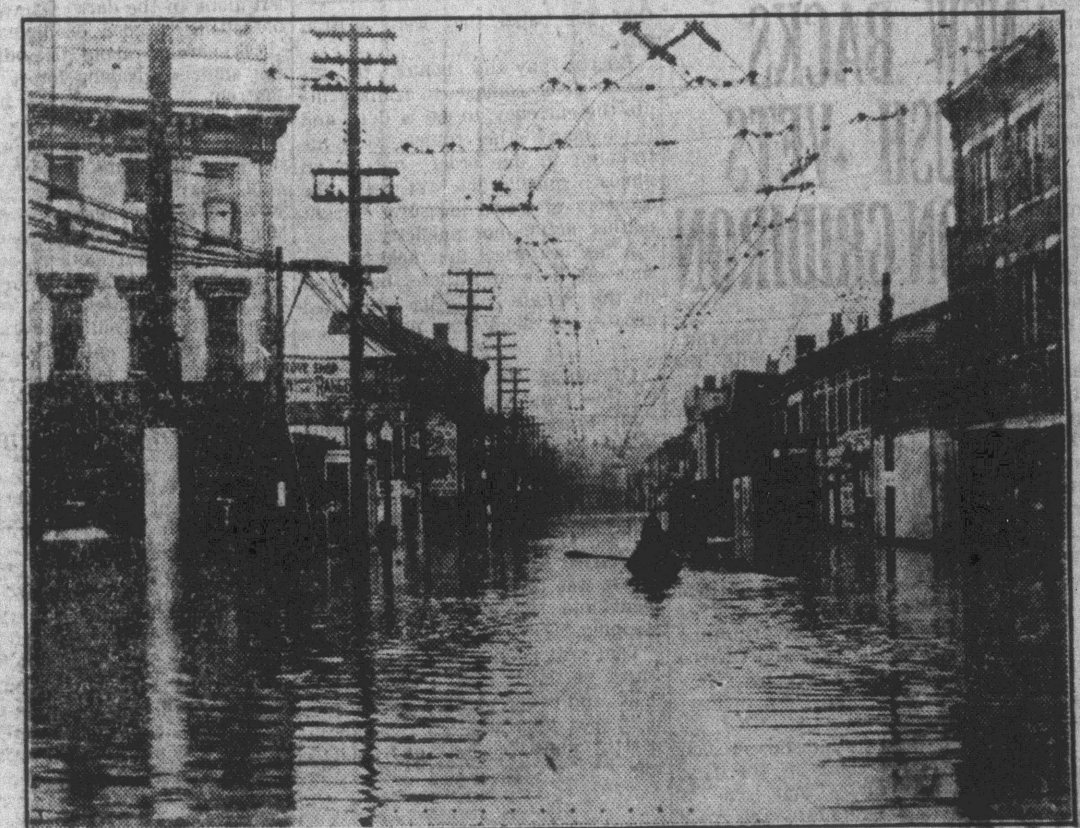
Rampant flood waters of the turbulent Ohio river and its tributaries spread death and destruction up and down the Ohio valley. Thousands of refugees faced new distress in freezing temperatures. This picture was taken in the northern end of Cincinnati where flood waters backed up six miles from Ohio river's normal course.