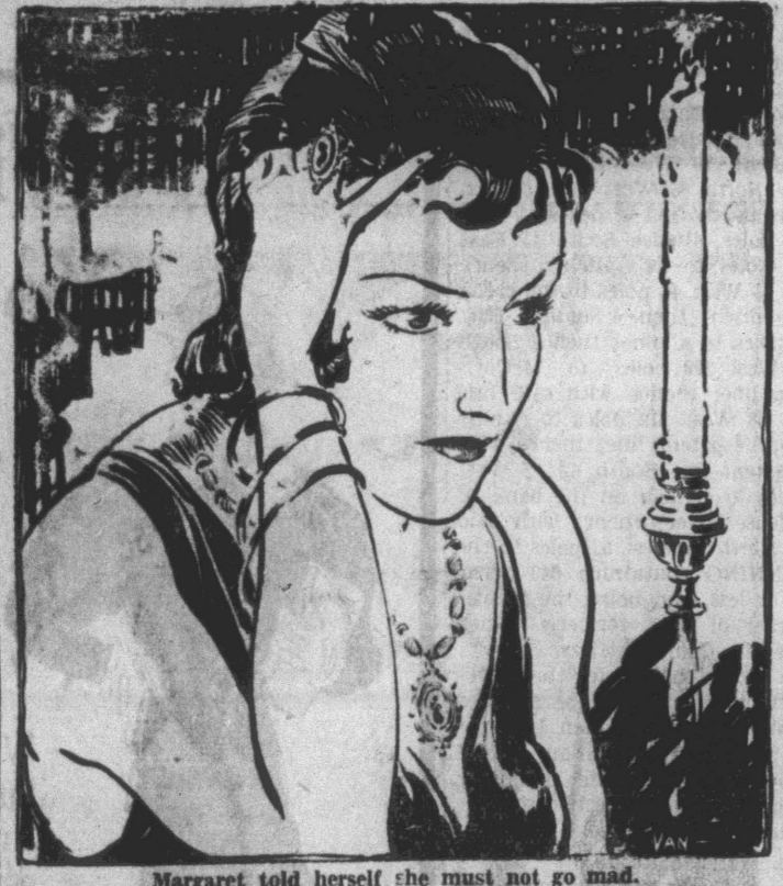
Margaret told herself the must not go mad.

VALLANT DUST by Percival Christopher Wren Chapter 40 JULES' TREACHERY Perhaps they had just dumped him somewhere, Otho thought, apparently dead drunk, where he would be found and chucked into a cell to sleep it off. But what was the game? And why, in spite of everything, was his heart singing a lark's song,