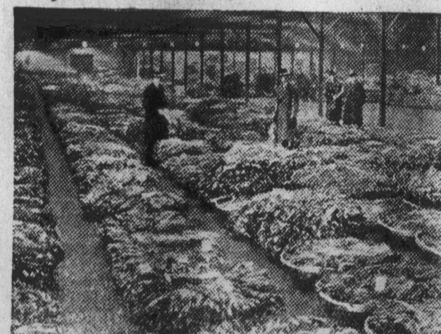
Auction today! Chesterfield buys the best