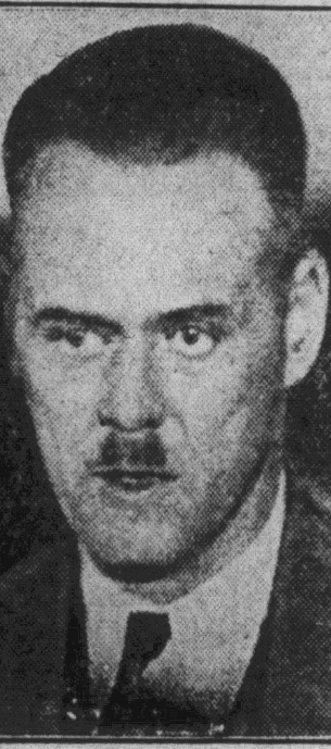
Col. H. Norman Schwarzkopf, head of the New Jersey state police, leads the investigation of the Lindbergh kidnaping case.