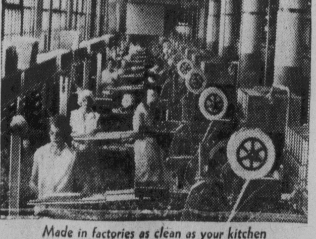
Made in factories as clean as your kitchen