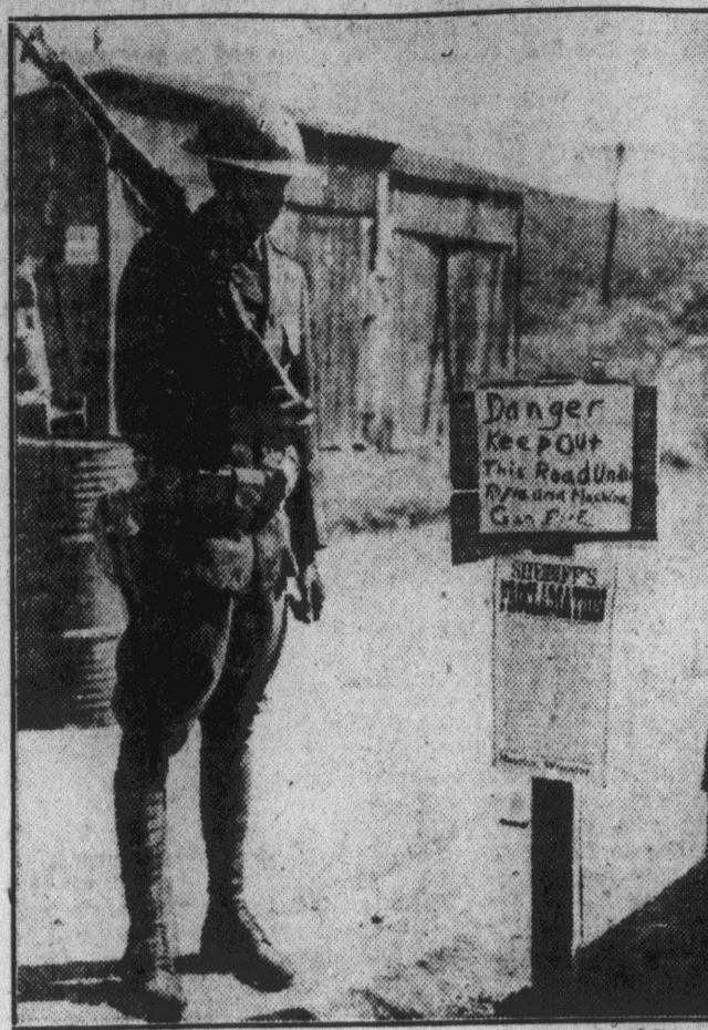
Several mines in the eastern Ohio coal fields resumed operations as national guardsmen stood by ready to protect workers against violence from striking miners. Here is a guard patrolling a road leading to one of the mines near Adena, Ohio, where three strike sympathizers were shot and wounded in a recent fight.