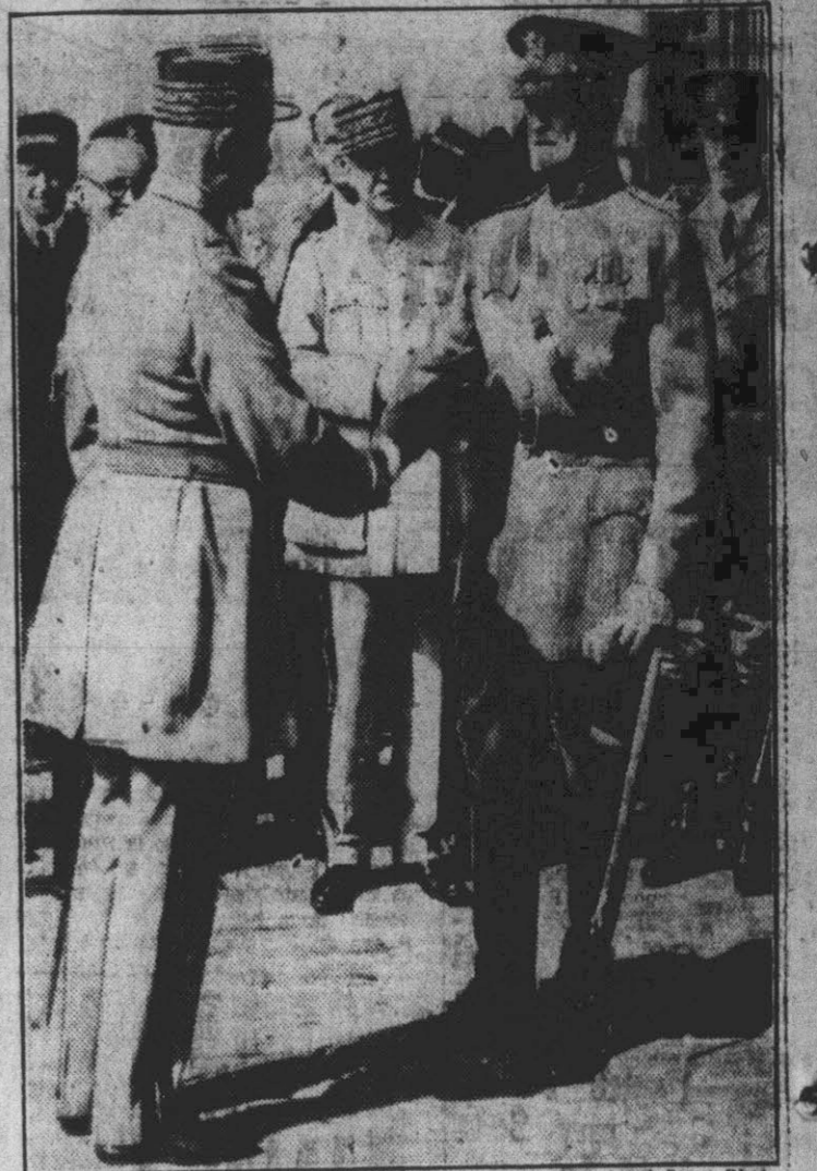
Henri Petain (left), marshal of France, was greeted by Gen. John J. Pershing when he arrived in Yorktown, Va., to help America celebrate the one hundred and fiftieth anniversary of the battle of Yorktown. The hero of Verdun and the American commander were associates during the world war.