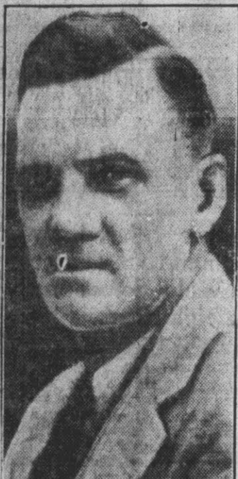
Max Carey is to take the place of Wilbur Robinson as manager of the Brooklyn Robins of the National League. Carey is a former Pittsburgh outfielder and later coach of the Robins.