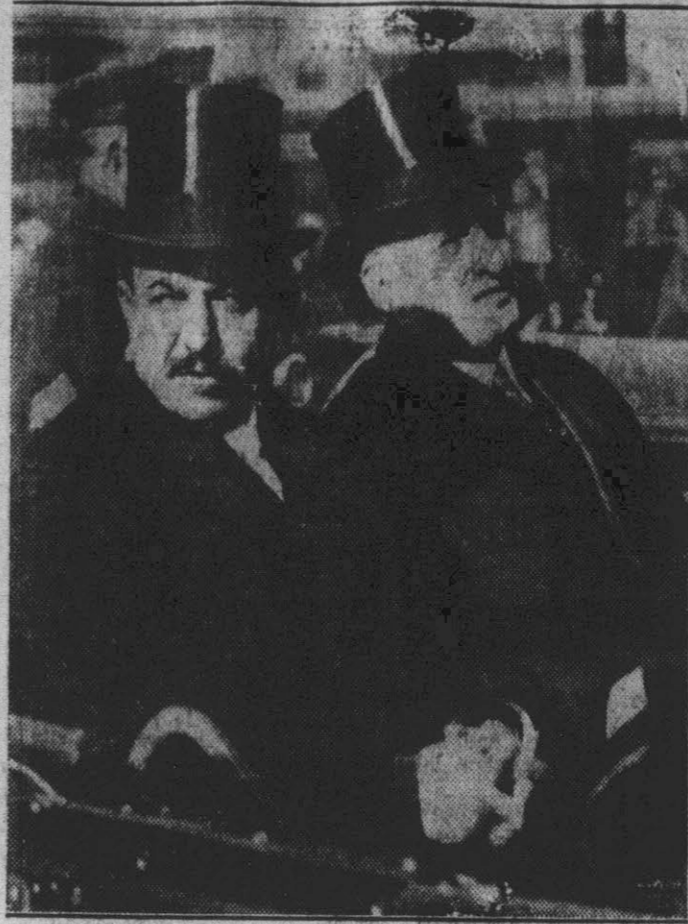
Premier Pierre Laval (left) of France is here to discuss with President Hoover methods of bringing about a broad readjustment of the tangled fabric of world economics. He is shown with Secretary Stimson who welcomed him to the United States.