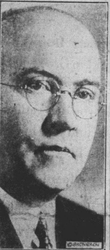
David Baird, Jr., republican candidate for governor of New Jersey. Is a possible appointee to the senate seat of the late Dwight W. Morrow