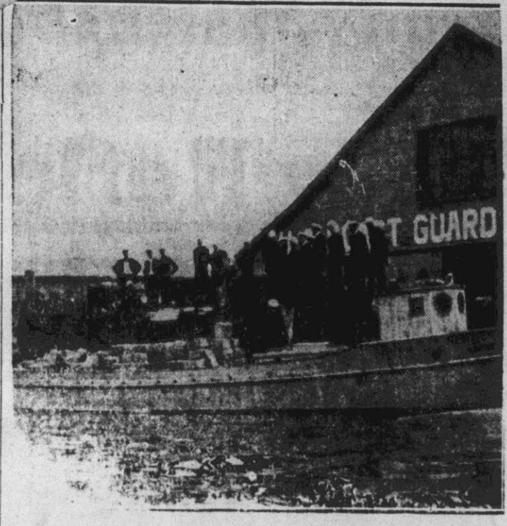
The rum runner "Lassahn" shown above, surrendered off Gloucester, Mass., but until one of the crew was killed by a bullet from a coast guard picket boat. Guardsmen said the boat was laden with 400 or more cases of liquor, and that it failed to stop for warning shots.