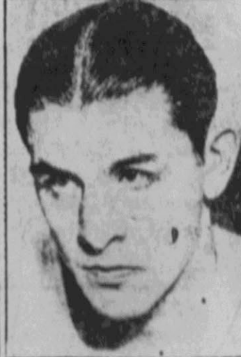
Tony Ganzoneri (above), light weight title holder, defends his title against the British challenger, Jack "Kid" Berg (below), in a 15-round bout in New York Sept. 10.