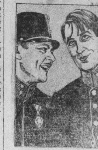
Maurice Chevalier, Charlie Ruggles in "The Smiling Lieutenant"

three-fourths of the cotton crop to become operative. Texas produces a third of the crop.