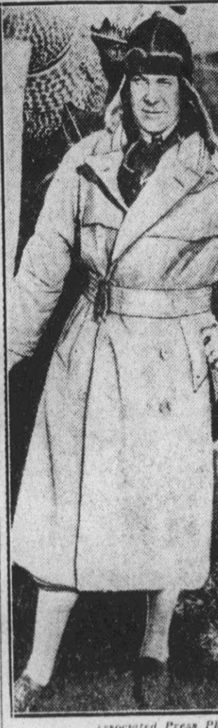
Ernst Udet, ranking German war ace, will compete in the national air races in Cleveland.