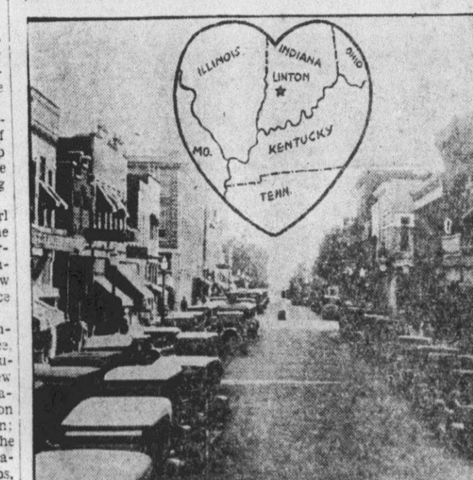
The census bureau has announced that the nation's center of population now is located 2.9 miles northwest of Linton, Ind., a small coal mining community whose main street is pictured above. Insert shows Linton's location in southwestern Indiana.