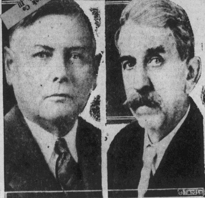
Gov. Ross S. Sterling (left) of Texas and Gov. W. H. "Alfalfa Bill" Murray of Oklahoma were involved in a heated controversy over the opening of toll and free bridges over the Red River at Benson, Tex.