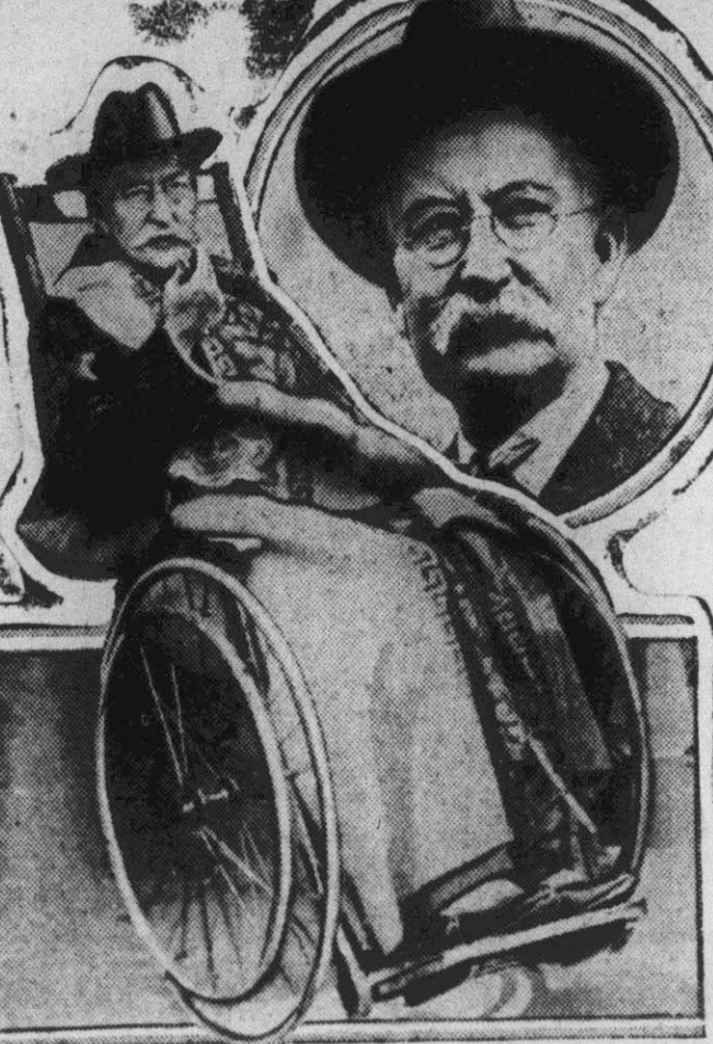
Convinced that Albert B. Fall of El Paso, Tex., former secretary of the interior, is physically fit to serve a year prison term, government counsel sought his removal to the Washington jail. Fall, shown here in two poses, was convicted of bribery in connection with naval oil land leases. He recently was examined by army physicians, and it had been asserted he was too ill to serve his term.