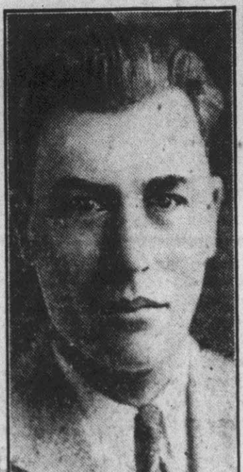
Edwin C. Johnson, lieutenant governor of Colorado.