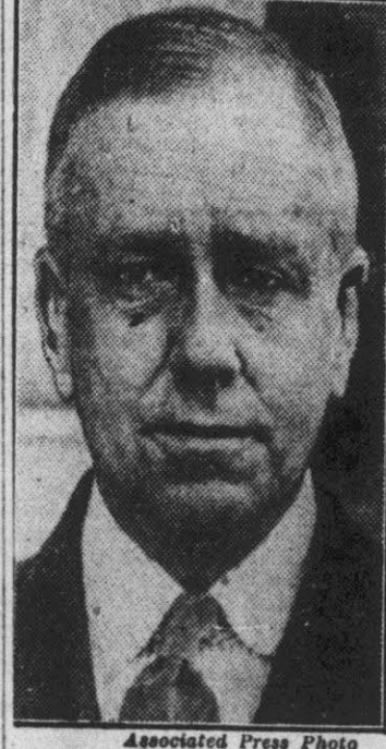
Frederic M. Sackett, United States ambassador to Germany, conferred with German leaders on President Hoover's war debt proposal.