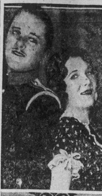
Scene from "Wenness Nights" A Warner Bros. Production. CAPITOL MONDAY and TUESDAY

Rescued From Lake. Detroit, June 26.—(AP)—A customs patrol boat today rescued 15 persons off Huron Point in Lake St. Clair after their fishing boats had been overturned and blown into the lake by a heavy windstorm. Eight persons were taken from Lake Erie by rescue parties, and all missing following the storm were believed accounted for.