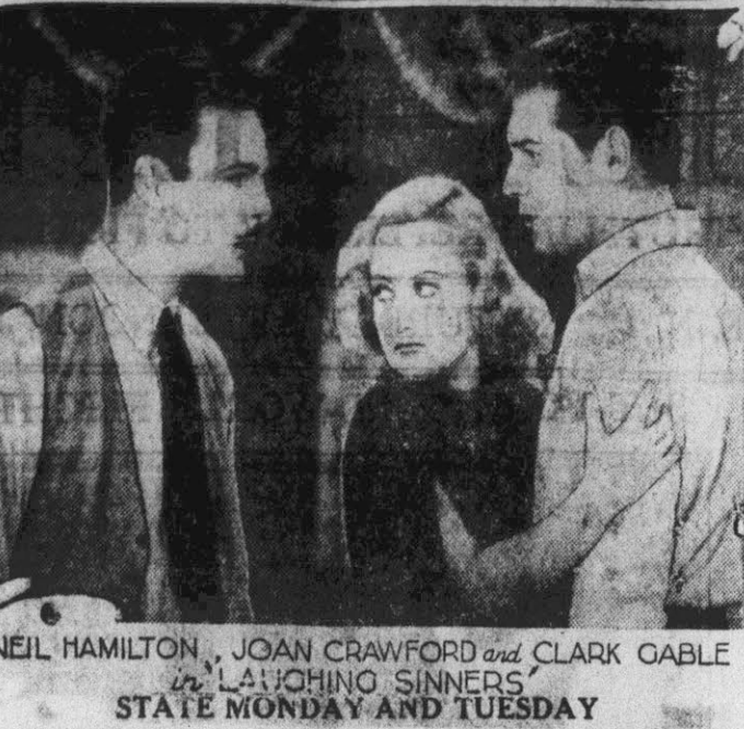
NEIL HAMILTON, JOAN CRAWFORD and CLARK GABLE in "LAUGHING SINNERS" STATE MONDAY AND TUESDAY