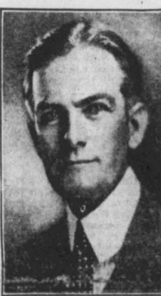
Paul B. Johnson, of Mattieburg Miss., is a candidate for governor of Mississippi, subject to the democratic primary in August.